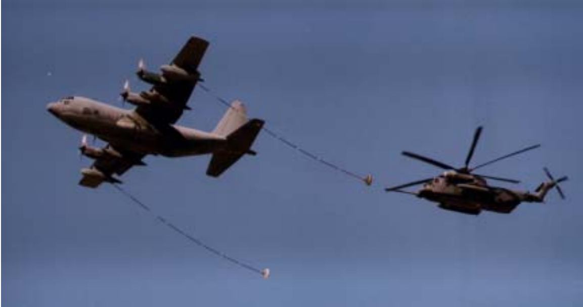
Figure 4 MH-53 Aerial Refueling

inevitably will in the future, they should be trained, funded, and provided assets to do so professionally. Placing Rescue and SOF together under SOCOM is the first step in the process.