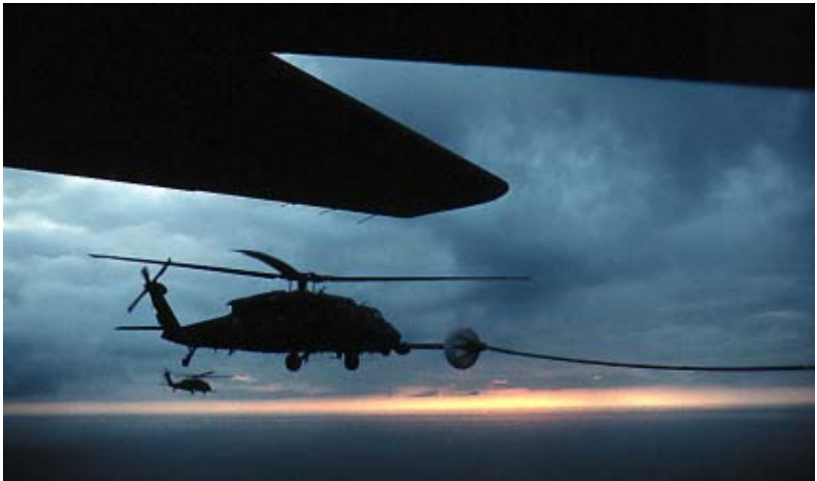
Figure 5 MH-60 in Contact Position

A second recommendation for further research goes one step further than the Airlift-Tanker study. This would encompass an evaluation of the vulnerability of AFSOC mobility assets in the years following 2015. In this timeframe it has been suggested that the threat-level will be such that C-130s will be unable to function safely. 4 If this is true it is now time to start planning for a new “SOF-specific” asset to replace the MC-130s, such as an MC-X. This asset would have to be a “faster, low-observable, long-range asset that can operate in a high threat environment” supporting SOF deep insertion operations. 5 It is time to research the need for this asset so that USSOCOM can efficiently plan for the required expense that will inevitably come as the MC-130s slowly wear out.