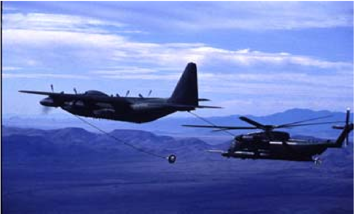
Figure 2 Helicopter Aerial Refueling

By 19 May 1966 the Aeronautical Systems Division at Wight Patterson AFB had completed their tests on the refueling capability of the C-130 and CH-3 aircraft. “Satisfied with the feasibility of in-flight refueling, the Air Force approved an initial rescue service order for eleven HC-130Hs converted for the aerial refueling role.” 31 These became the first HC-130P air force aerial refueling tankers. The first in-flight transfer of fuel between an HC-130P and an HH-3E aircraft occurred on 14 December 1966, and air force crews were conducting combat Helo AR in June 1967 over the jungles of Southeast Asia. 32 In-flight refueling offered rescue forces added flexibility by extending the helicopter’s range while allowing them to orbit, “thereby cutting down the time it took to reach airmen down in Vietnam and Laos.” 33