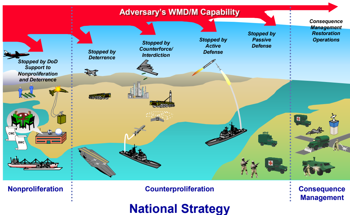
Figure 1: DoD's Multitiered Approach to Combating WMD

Joint Combating WMD Doctrine. JP 3-11, Joint Doctrine for Operations in Nuclear, Biological, and Chemical (NBC) Environments , provides combatant commanders, subunified commanders, joint task force commanders, and components of these commands with strategic and operational-level concepts and guidelines for how to effectively plan and execute joint and multinational NBC military operations throughout the entire battlespace. It provides joint operational doctrinal concepts to better integrate the effective use of passive defense capabilities, including medical capabilities, to enable U.S. military forces to survive, fight, and win in an NBC-contaminated environment. This operational doctrine is centered on the principles of avoidance, protection, and restoration of combat operations. JP 3-11 also provides the same strategic and operational-level guidance for peacetime, crisis, conflict, post-conflict, and military operations other than war. Joint Publication 3-40, Joint Doctrine for Counterproliferation Operations (2000) , established the conceptual linkages necessary to support COCOMs' planning and execution of CP tasks and missions. JP 3-40 is currently under revision to reflect the CbtWMD National Strategy, and is to be titled Joint Doctrine for Combating Weapons of Mass Destruction .