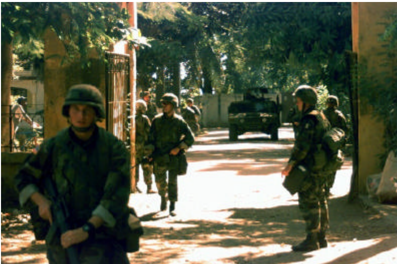
US Troops on Patrol.

The plenary session revealed a number of common themes in all four scenarios. Paramount, the United States must adequately protect its own people at home and abroad. Reflecting the contestable nature of conventional deterrence, opponents will seek to deter the United States and its allies from deterring them. The United States is vulnerable to adversary deterrence through mass casualty asymmetrical threat. Vital elements in deterring asymmetrical attack are crisis management to prevent attack and consequence management to mitigate the effects of an attack. Effective missile defenses (especially theater) were frequently mentioned topics during discussions in each of the scenarios. A nationally coordinated all-hazards defense was deemed prudent. Adequately protecting United States people is not synonymous with the concept of casualty aversion. The conference participants were generally skeptical that loss of lives would per se deter the United States. The American people will bear the burden and pay the price for preserving the United States and its vital interests. However, should the case for engagement not be made adequately, casualty aversion may adversely affect engagement in conventional deterrence.