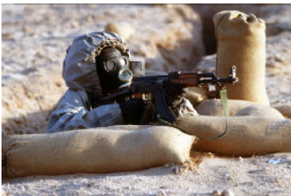
The Chemical Threat.

Arms control and counter proliferation remain and will become even more important factors in marshalling world opinion to reduce conflict. In regions of the world where there is balance between competing regional powers it is essential to maintain that balance by deterring proliferation and arms races.