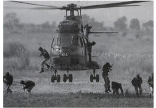
Troops Conduct an Air Assault.

Conventional deterrence is an essential tool in “shaping” the world environment. All elements of national power are involved in conventional deterrence. Coordinated interagency processes should be enhanced. Cultural ways of thinking within agencies need to be changed to reflect the interagency processes and strategic perspective. Interagency operational processes should be formalized at the regional level. Conventional deterrence is effective only if the United States has the credibility, the will to act and the capability to compel actions through use of all its elements of national power. Credibility is achieved through continuous economic, military and political engagement. Ultimately the capability to compel compliance by the rapid, effective use of military power is essential to deter.