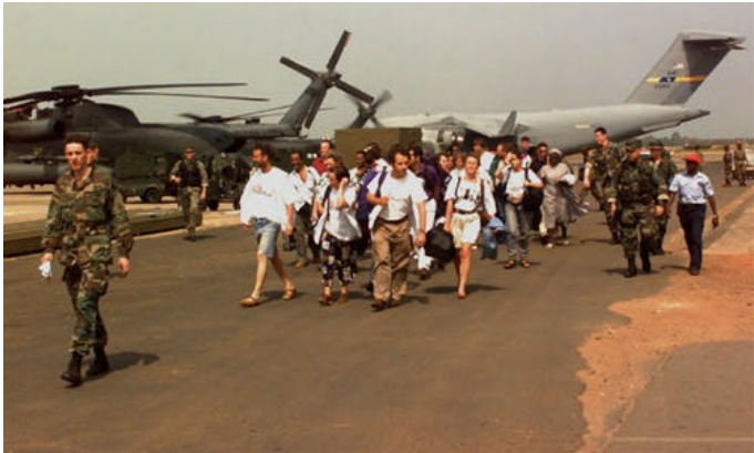
Non-combatant Evacuation of US Citizens.

The participants divided into two groups to examine future threats to the interests of the United States and the role of conventional deterrence using four disparate scenarios occurring in the year 2017. Considerations included the utility of conventional deterrence to deter a massive non-state insurgent/criminal entity threatening bioterrorism, a crisis between two developing states regarding access to oil reserves, a crisis stemming from competition between states for access to a limited water resource, and a high-end crisis involving two regional nuclear capable states.