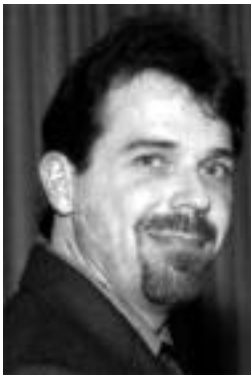
Vincent Park Naval Research Laboratory (NRL)

Computer and communication networks such as the Internet are multilayered, highly complex systems that rely on a plethora of protocols and algorithms for seamless, reliable operation. However, the traditional routing algorithms used in today's networks are designed for operation in relatively static hardwired networks and are not well-suited for emerging mobile wireless networks. Park has created an enabling technology for the development of mobile wireless networks.