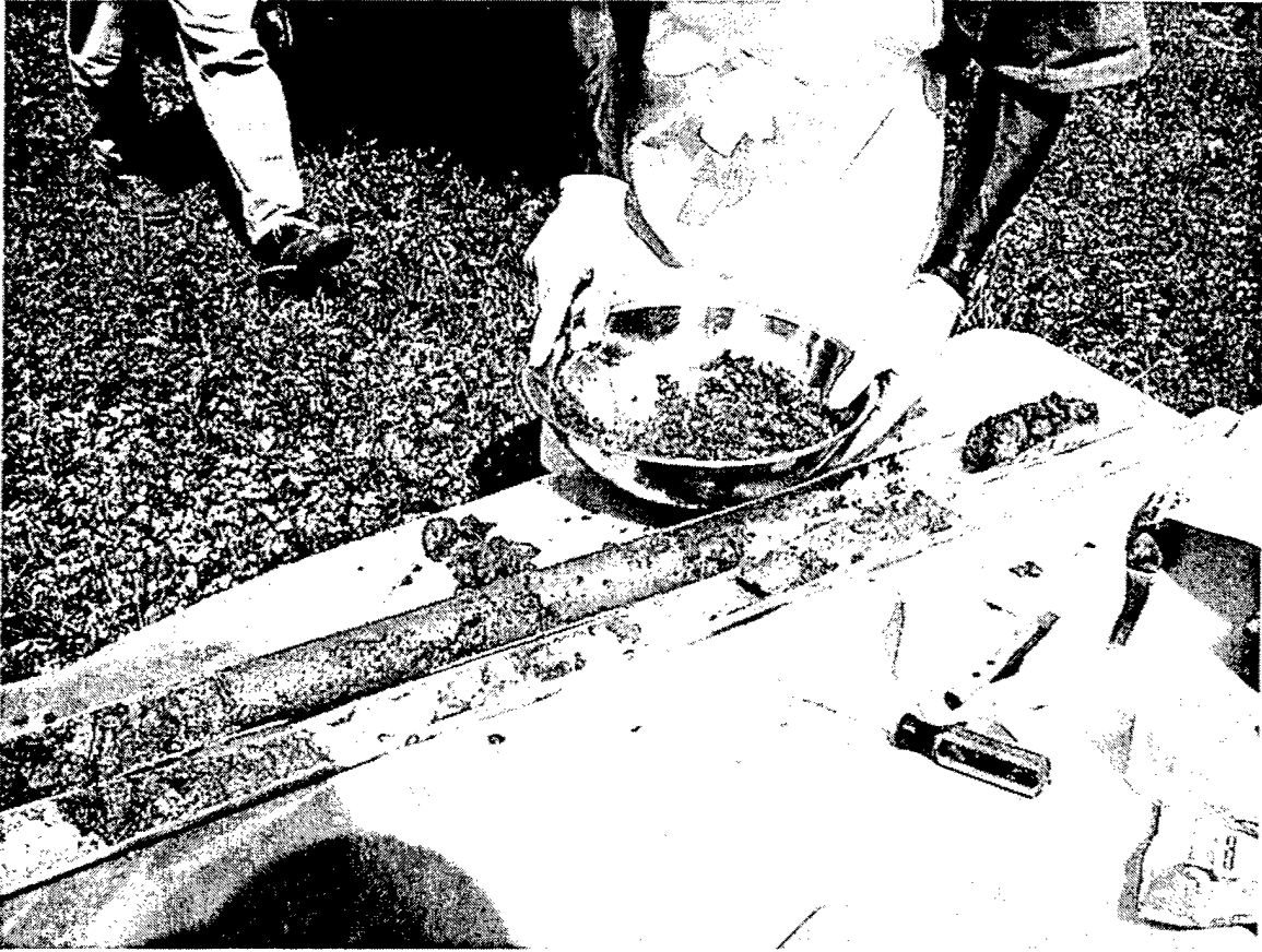
Photo C-3: Five-Foot Soil Core with Sample Interval Removed and Composited in Bowl