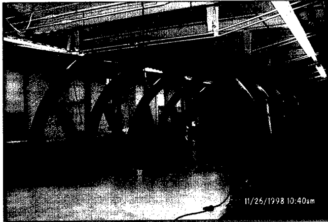
Figure 2. Inflatable textile air beam frame