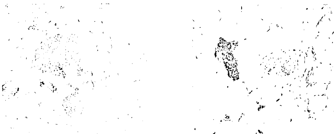
Unprotected Mammary Gland (10 \mu g of E) at Metestrous 200X Magnification