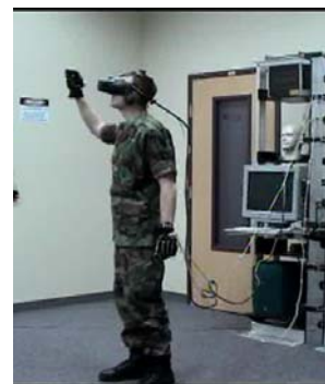
Figure 2. Concept for GOSE immersive system with improved HMD and data gloves.

Inclusion of a haptic (feedback) interface and stereoscopic glasses, along with use of three-dimensional models and synthetic voice commands, in the next phases of development should provide the end-user greater flexibility and increased realism in the immersive environment. The improvements are expected to further increase training effectiveness and reduce cybersickness. Evaluation of GOSE is planned following completion of the each phase of development. For comparative purposes, assessment criteria used to evaluate GOSE will include the same criteria used to evaluate VEST.