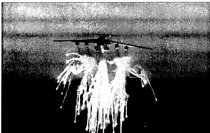
Figure 2: C-141B Starlifter Ejecting Flares on Takeoff

employment of directed IRCMs (DIRCMs), that focus their IR energy directly on the incoming SAM. DIRCMs are able to generate more jamming power than IRCMs, and may offer the most effective defense against modern shoulder fired SAMs. DIRCM weight, size, cost, and reliability, however, may not yet make them attractive for commercial airlines.