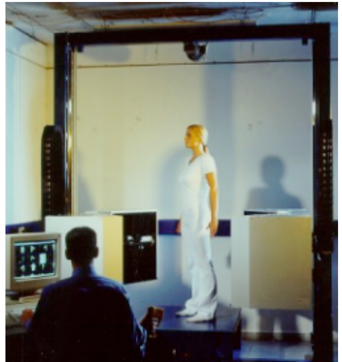
Figure 2. The Vitronic Vitus Pro 3-D laser scanner.

Both the WB4 and the Vitus Pro are factory-calibrated, but the process for fine alignment of the Vitus Pro range data is significantly different from the process used for the WB4. The fine alignment process for the WB4 determines correction factors that are then applied to all subsequent scans until another alignment check is performed. This alignment correction process is a function of the CyPie software. The fine alignment