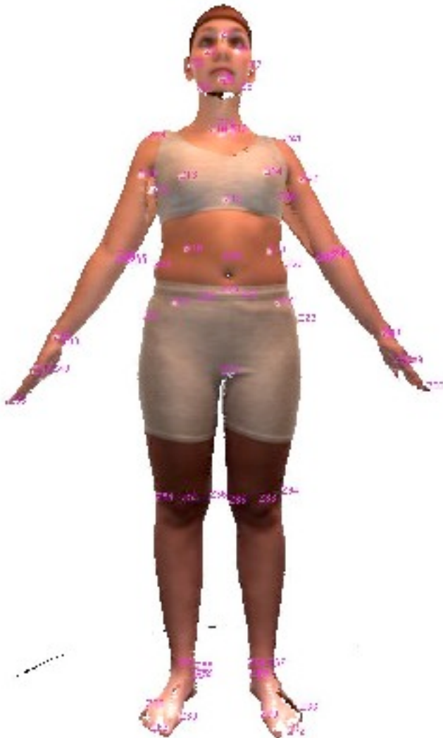
Figure 3. 3-D scan showing surface color information; landmark markers are visible in this view.

Landmarks were captured by placing markers at the time of scanning on each subject at pre-determined positions representing an important point for either measurement or segmentation. These landmarks are visible in the scan data, and are usually positioned over bony points that are not otherwise directly visible on the scan and must be placed by palpation of the area to determine the exact bone position. Landmark coordinates are extracted from the scan by using either a semi-automated procedure for large volumes of data (e.g. CAESAR) or by an entirely manual process using INTEGRATE for smaller volumes of data such as this comparison study. A quality-control check at the end of landmark extraction ensures that either process produces accurate landmark coordinates.