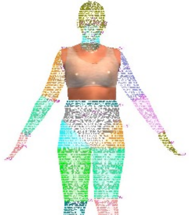
Figure 4. Segmentation according to McConville et al, with the thorax highlighted.

Datasets were segmented according to McConville et al, 1980 5 , using the scan coordinates of landmarks placed on each subject and extracted from the scans as noted above. In this study, only the thorax segment was of interest, and only the standing poses were used. Segmenting the thorax required cuts at the neck to remove the head and neck, a cut at the bottom of the rib cage to remove the lower torso and legs, and a cut at each shoulder to remove the arms. Segments were aligned by using a least-squares fit between the thoracic landmarks on different scans.