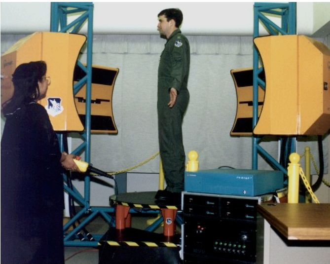
Figure 1. The Cyberware WB4 3-D laser scanner.

The data from the four (4) scan heads is merged into a single dataset by a Cyberware-supplied program called CyPie, after which the data is in a form and format that can be used to visualize, analyze, and manipulate the data to extract information from the dataset as needed using a CARD-Lab-developed program called INTEGRATE 3 .