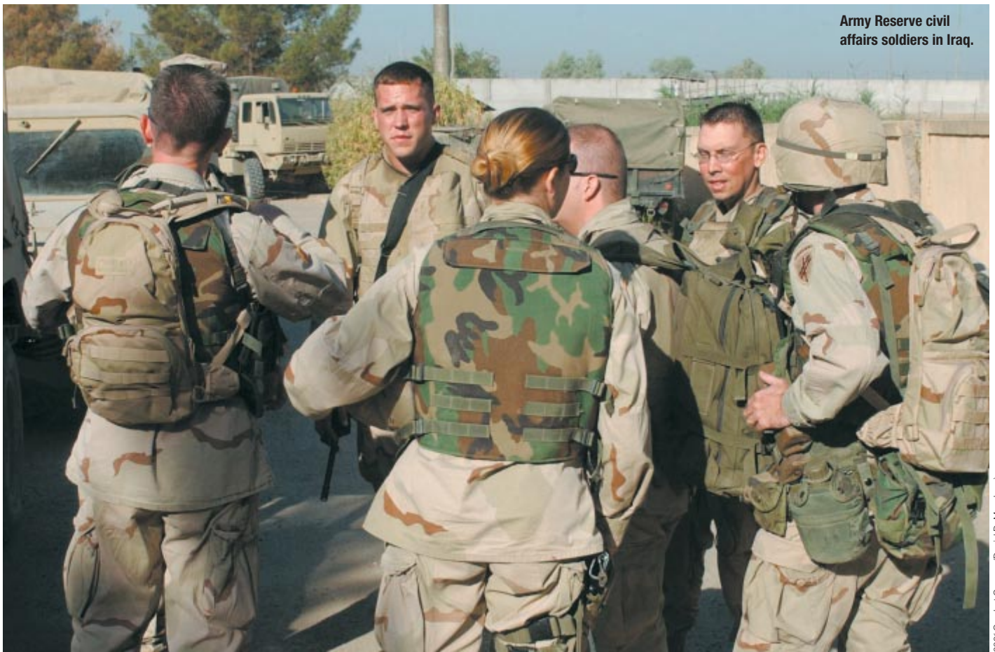
Army Reserve civil affairs soldiers in Iraq.