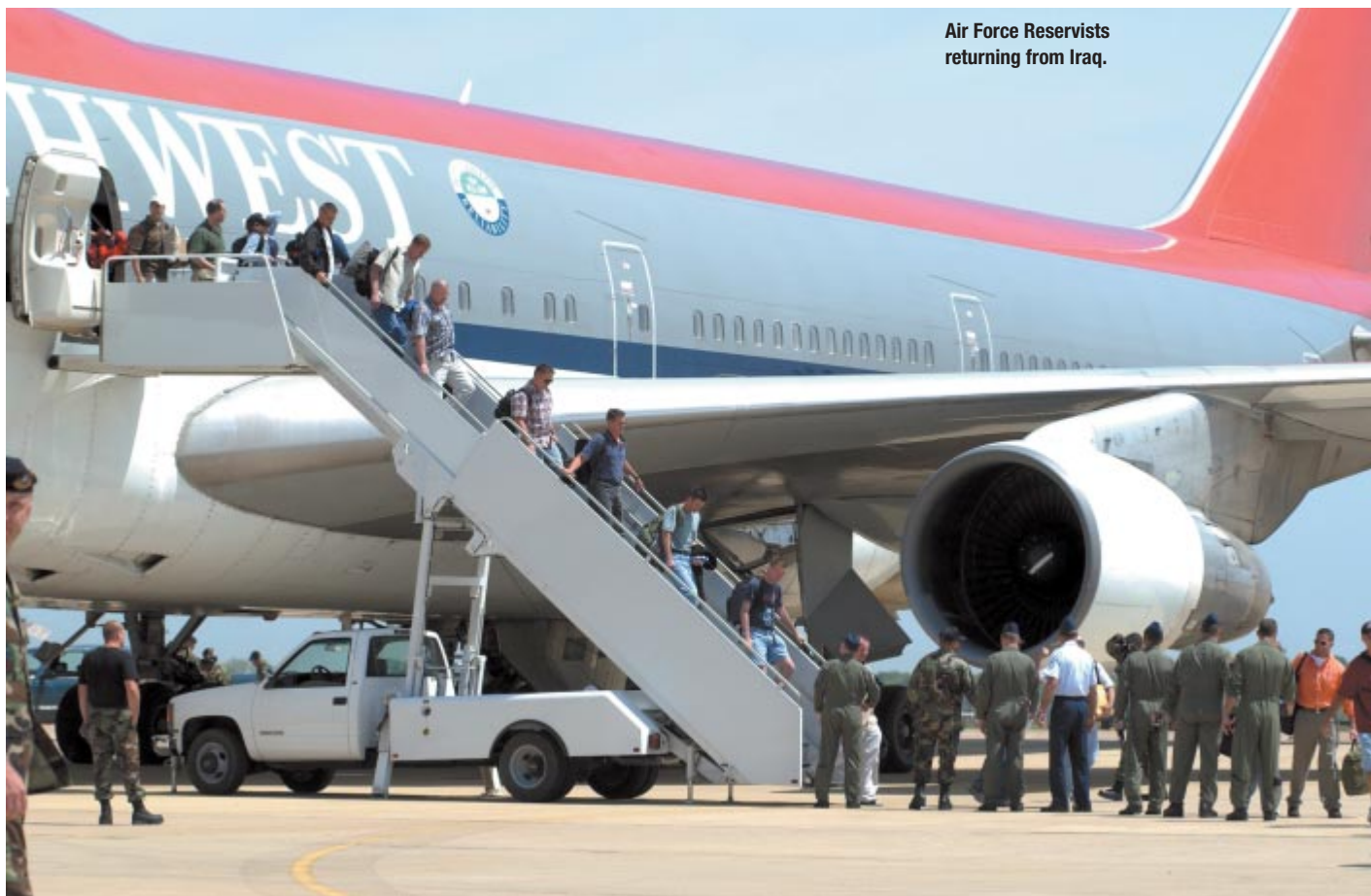
Air Force Reservists returning from Iraq.

2 d Communications Squadron