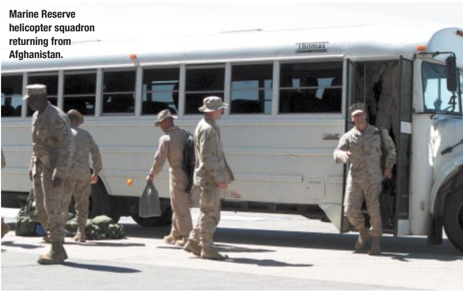
Marine Reserve helicopter squadron returning from Afghanistan.