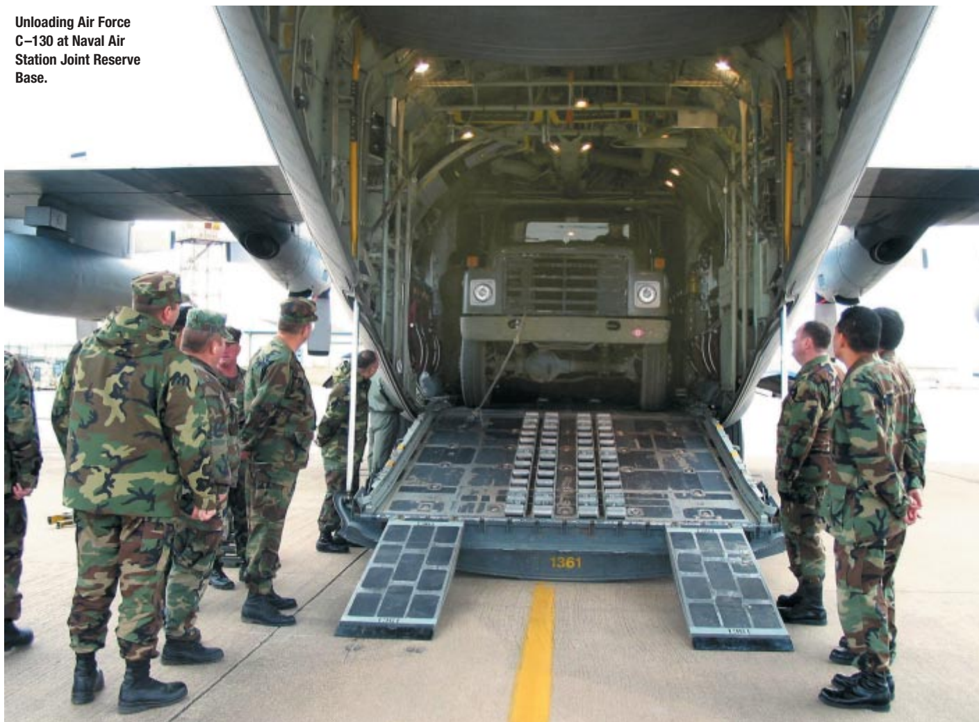
Unloading Air Force C-130 at Naval Air Station Joint Reserve Base.