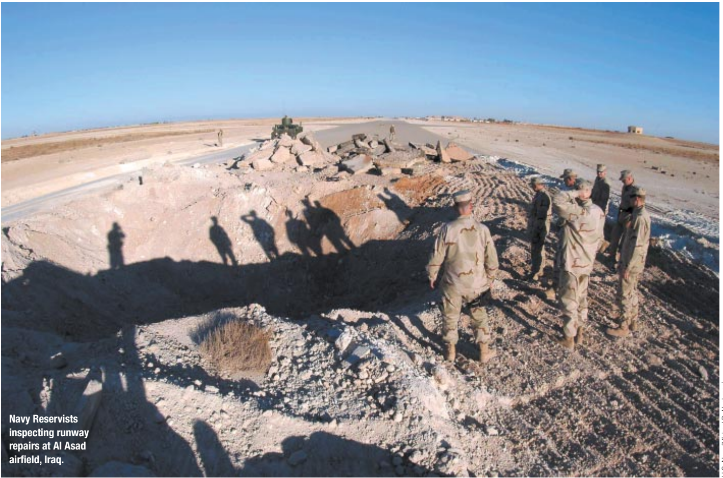
Navy Reservists inspecting runway repairs at Al Asad airfield, Iraq.