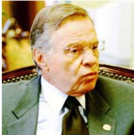
President Rodriguez of Costa Rica.

conference for South America in Paraguay in November.