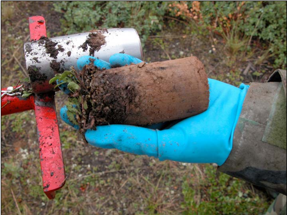
b. Plug sample from the corer. Note soil gradations.