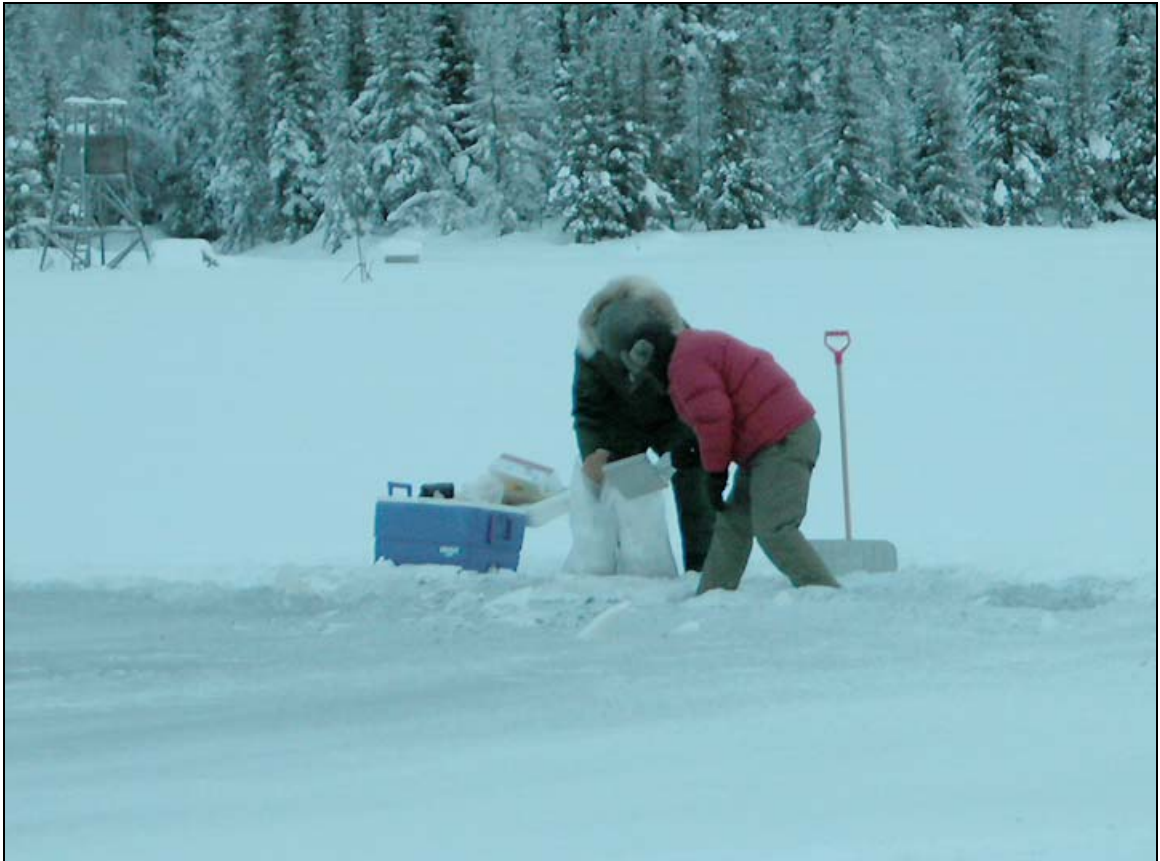
Figure 8. Composite sampling on snow with a 20-cm tool.