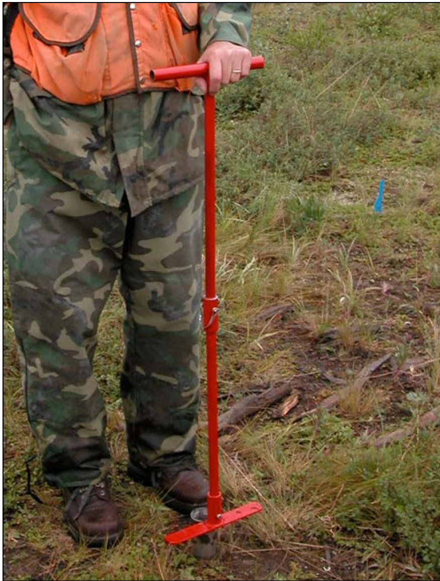
a. Assembled corer.