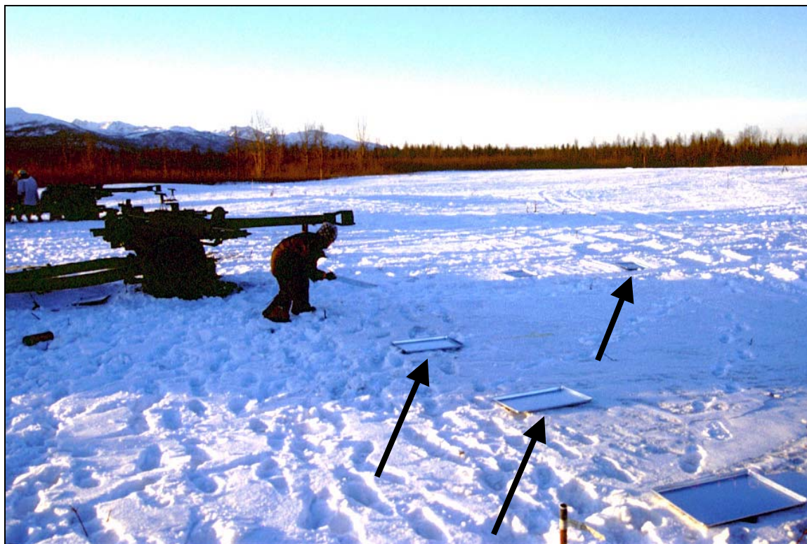
a. Placing trays prior to firing.

In addition to collecting residues from the surface using scoops, we have also used pre-placed trays when sampling BIPs. The trays are 43 \times 63 cm with a 3-cm rim. We have used them on both soil and snow, at detonation locations and firing points (Fig. 5). When used during winter tests, they are very effective at collecting particles for later analysis. They also work well in summer, although dust and some soil is inevitably deposited on them following detonation. They were very useful when used to recover small whiskers from the propellants used when firing howitzers during a winter live-fire test.