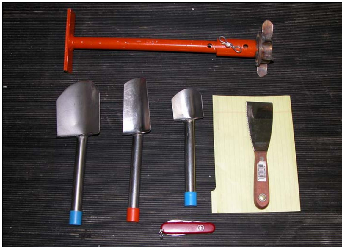
Figure 3. Non-cohesive soil sampling tools.