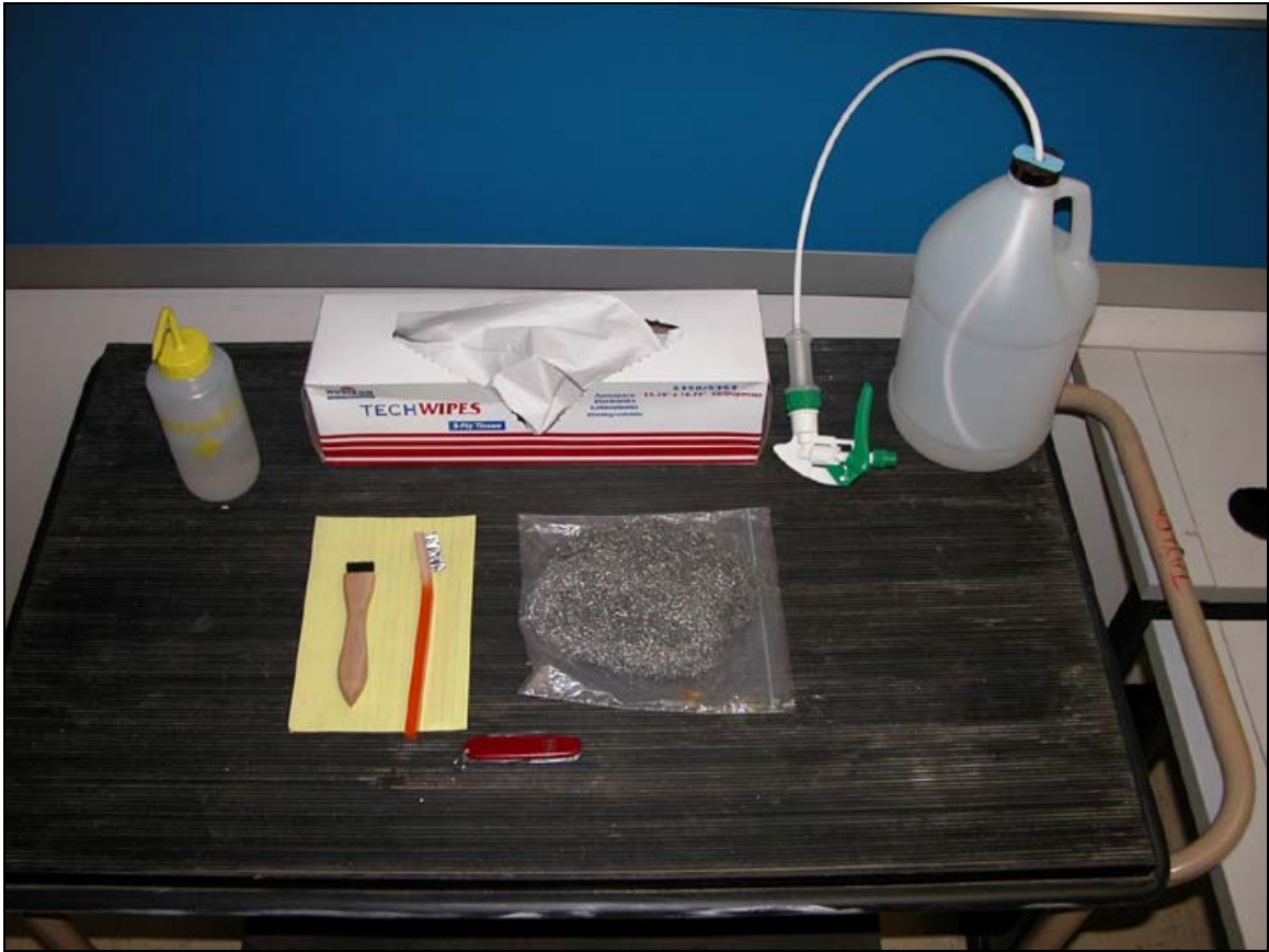
Figure 2. Field cleaning supplies and equipment.

Figure 3 depicts tools used for non-cohesive soils, such as sand or gravel. The device to the rear of the image is called a cookie cutter. It forms a 4.5-cm-diameter by 2-cm-high puck when placed on the ground and twisted. The puck can then be scooped into the composting bag with one of the stainless steel sample scoops (AMS Part numbers 428.02–06). Not shown is a hammer corer available from AMS (Part number 404.61) that is used to obtain short (<12-cm) cores in very rocky soils. This is an all-stainless device with which we have had very good results.