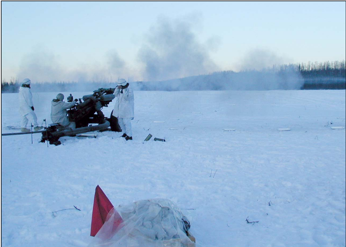
b. Trays in use during a live-fire exercise.