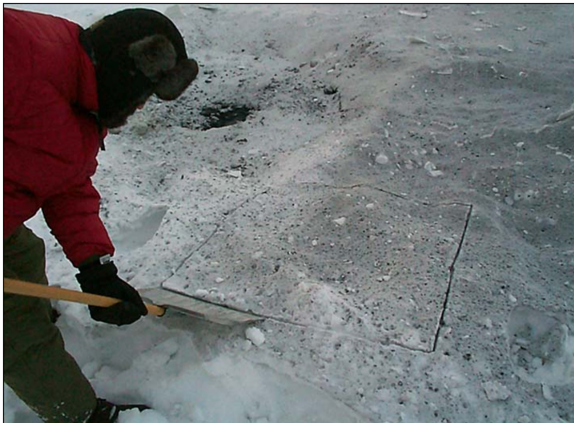
Figure 7. Sampling a 1-m 2 area of snow next to a detonation point.

The scoops are very easy to use and quite effective when taking composite samples (Fig. 8). It is easy to gauge depth, ensuring a complete sample is taken. There is no spillage when placing the sample in the compositing bag. They are lightweight and easy to clean. In some cases, the 20-cm scoop has been used in difficult locations to acquire the large (m 2 ) discrete samples. They do a thorough job, but are slow.