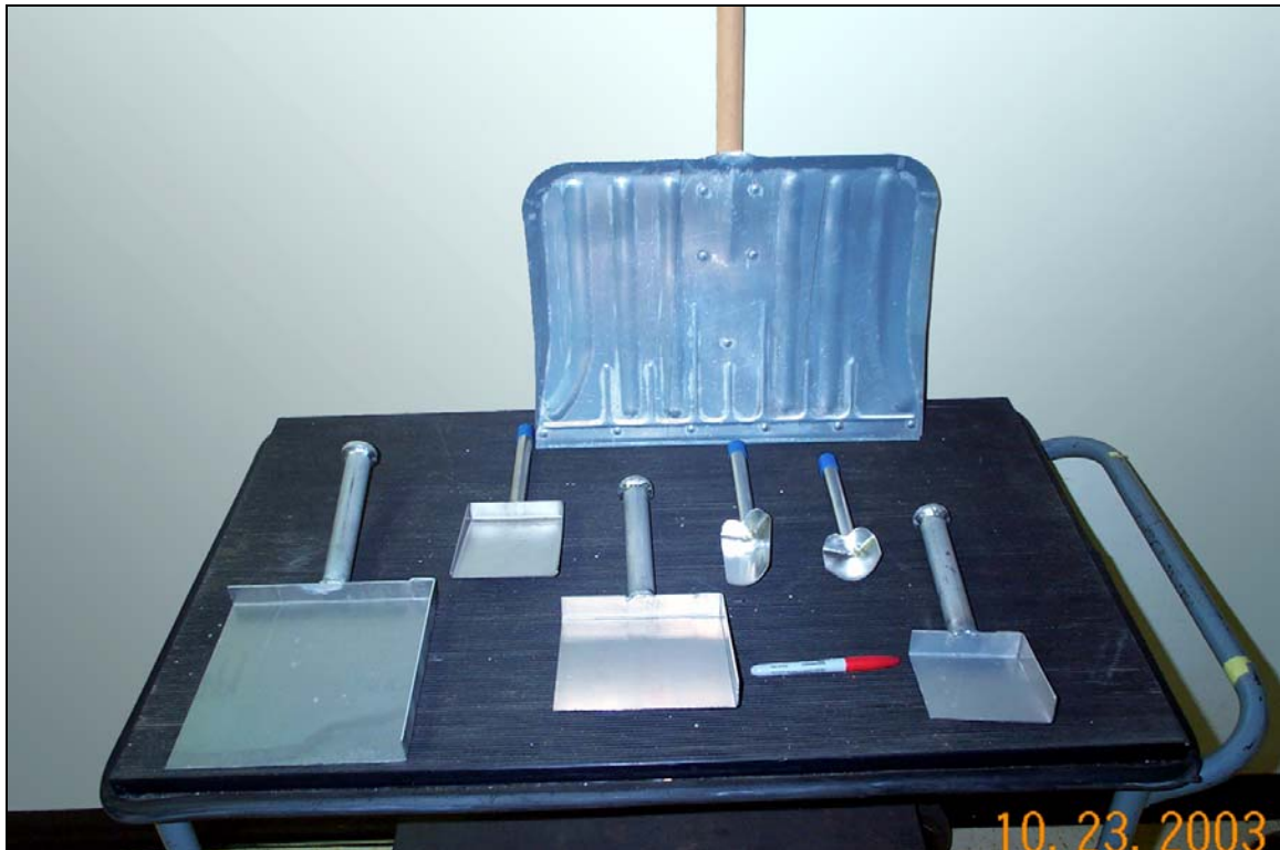
Figure 4. Snow sampling tools.

Current practice is divided into two strategies: Obtaining several (15–30) large-area ( \text{m}^2 ) discrete samples or a few (1–3) multi-increment composite samples for each event. The tools differ for the application. For large-area discrete samples, a PTFE-coated aluminum snow shovel is used (Fig. 4). This shovel has the upper corners bent in to facilitate loading the sample bags. There is no depth control to achieve the 2- to 3-cm depth required for a standard sample. The sampling area is demarcated by outlining the area with the shovel blade, which is 46 cm in length. Remnant residue in the 1- \text{m}^2 sampled area is cleaned up using one of the small stainless steel scoops shown in front of the shovel.