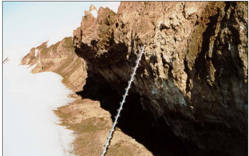
Figure 1. Banks are highly susceptible to failure upon thaw.

FT effects increase soil erodibility and instability such that overland runoff and floods in the spring often erode significantly more thawed upland and bank soil than at other times of the year (Renard et al. 1997). Research shows that in areas where seasonal frost forms, processes related to soil FT contribute to 40 to 85% of overland soil erosion (Zuzel et al. 1982, McCool 1990) and 30 to 90% of bank failures (Thorne 1978, Sterrett 1980, Gardiner 1983, Reid 1985, Lawler 1993, Chase et al. 2001). When rills (Fig. 3) are present on hillslopes they transport 80% of the sediment eroded from that slope (Mutchler and Young 1975). Thus, rill flows are far more important in hillslope erosion than overland sheet flow.