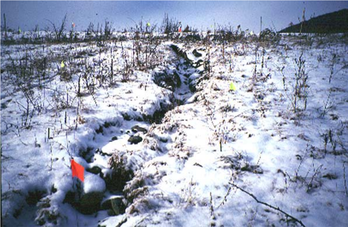
Figure 3. Rill formation is enhanced in frost-susceptible soils as a result of freeze–thaw cycling.

Our research shows that rill development and sediment erosion by channelized flow on a thawed frost-susceptible soil are increased between 1.2 and 4.9 times after just one FT cycle (Ferrick and Gatto in press). The precise magnitude of this increase is directly related to soil moisture. Soil moisture is often high upon thaw and can be equally important in bank failures. Our observations show substantial variations in soil moisture along a silt bank face and between banks with different orientations. Total FT cycles, and freezing intensity and duration, also vary with bank orientation (Gatto and Ferrick in press).