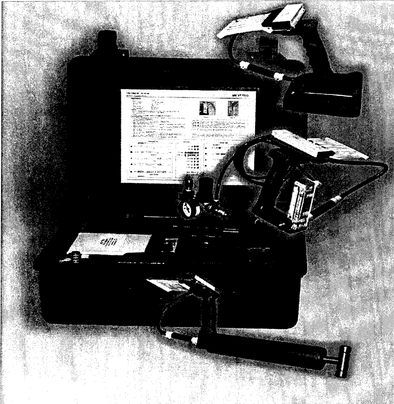
Figure 1. NEXTEQ Civil Defense Kit™

With these pump options, the power requirement, size, and weight of the Civil Defense Kit™ system will vary depending on the pumping system used. The hand piston pump is manually operated and requires no power supply. The electric pump uses a standard 120V AC outlet and weighs approximately 2 lb. The venturi pump attachments require a gas source such as a firefighter's breathing tank. In all cases the kit is an easily manageable hand held detection system. Figure 1 is a picture from the manufacturer of the Civil Defense Kit™ showing the manifold attached to the three different pumping system options. Due to time constraints and for test consistency, only the electric pump was used during the DP evaluations of the system.