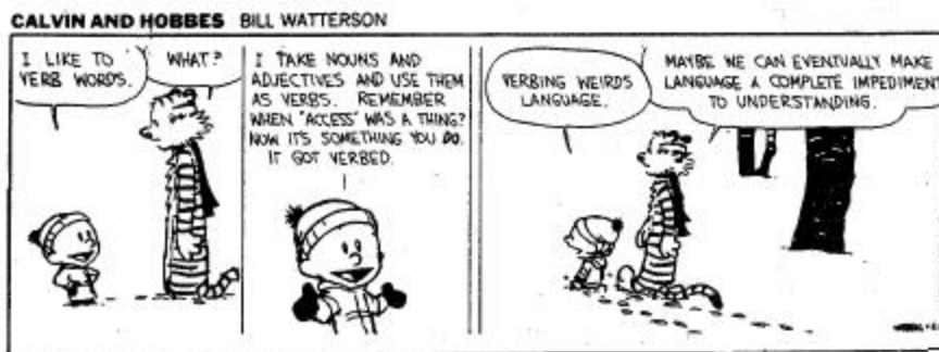
Calvin and Hobbes. ©1993, Waterson. Reprinted with permission of Universal Press Syndicate. All rights reserved.