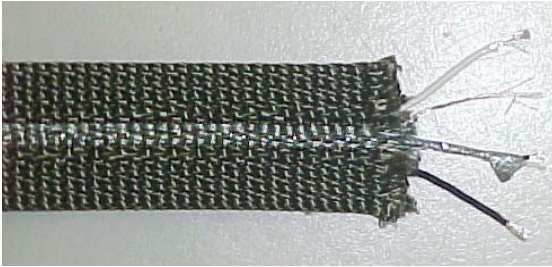
Figure 1. Textile-based USB

cyclic loading, and after laundering (Slade 2003). A similar electro-textile data and power transmission device was developed for the point-to-point personal area network for Future Force Warrior and serve as its electronic backbone.