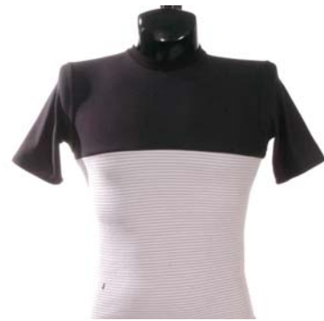
Figure 3. Body conformal t-shirt

Both fastex and snap connector configurations were developed to support a variety of military applications. The universal snap fastener, as shown in Figure 4, securely attaches to any textile embedded conductive network. The male connector also serves as a platform for sensor attachment.