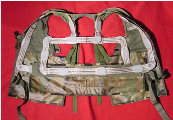
Figure 2. Double loop antenna integrated into MOLLE vest with ergonomic modules

Narrow fabric technology was also used to develop a radiating conductor for body borne antenna applications. The antenna vest, as shown in Figure 2., met all permissible exposure level standards inside and around the antenna vest. In addition, communications ranges compatible with the Single Channel Ground and Airborne Radio System were achieved while standing, kneeling, and crouching demonstrating its omni-directional performance.