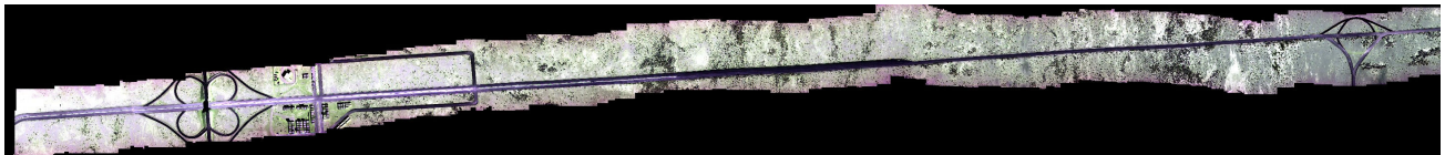
Figure 1. True color mosaic of Yuma roadway from Feb. 11, 2004.

Slama, C.C. (Editor), 1980. Manual of Photogrammetry. American Society of Photogrammetry, 1056 pp.