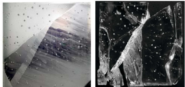
Fig. 3: Compression test specimen made from lake ice from Location 3 (middle of lake). Left: untested. Long and straight grain boundaries are visible in polarized light. Right: tested. Ice failed readily at only 3-4 MPa (compared to 9-10 MPa for lab S2 ice) through cracking and sliding along the inclined grain boundaries.

grain boundaries (see Top of Location 3 ice in Fig. 2). Such grain boundaries are weak interfaces that will readily crack and slide under relatively low applied loads causing the specimens to fail prematurely (Fig. 3). At the other extreme is the deeper and rather exclusively S1-oriented ice, which has been shown to be 1.5-1.7 time stronger than laboratory grown S2 ice (16-17 MPa compared to 10-11 MPa under similar loading conditions).