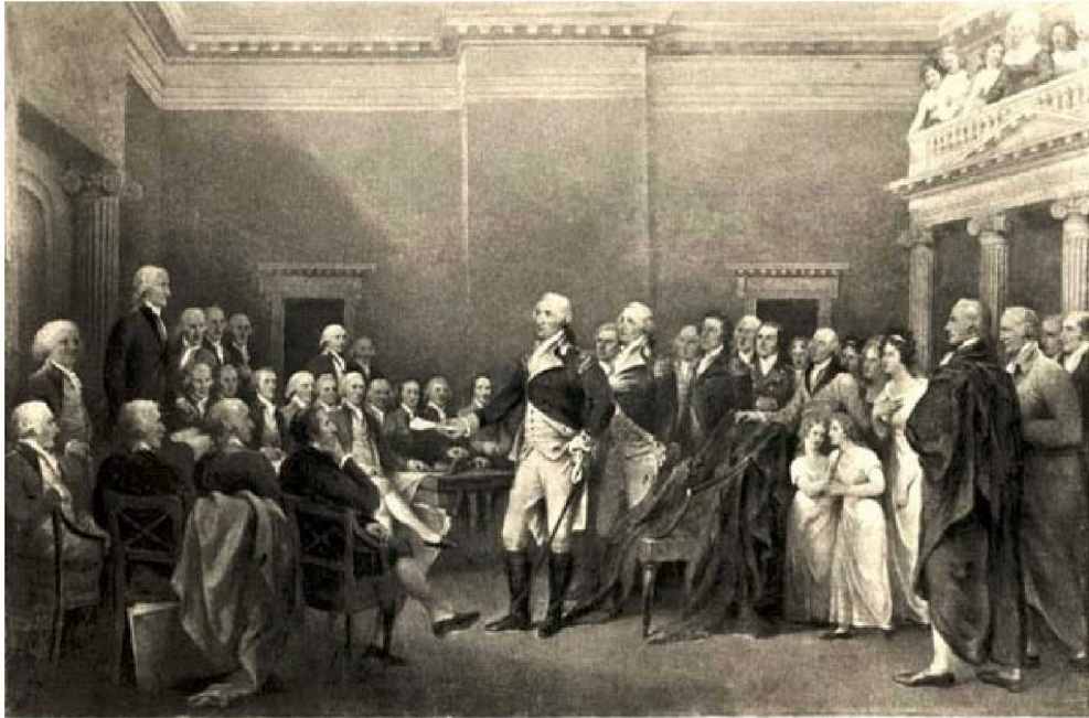
Figure 4. The Resignation of General Washington by John Trumbull, 1824 80

Washington always intended his act of resignation to be simple. Therefore, he would be pleased with the manner in which most artists have represented him—and especially delighted with how his countrymen have come to regard him. So deliberate were the early efforts to present him as the model citizen-officer of a new egalitarian nation, and so quickly were those efforts embraced by the populace, that later artists were unexpectedly met with ridicule when their works appeared even the least bit grandiose.