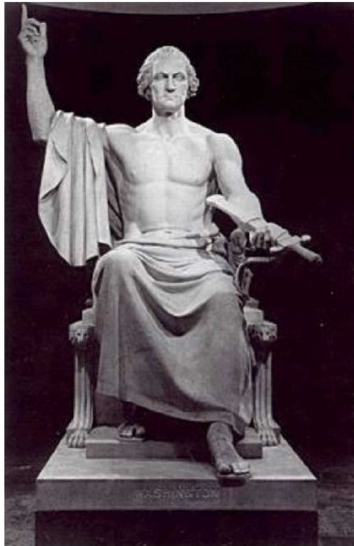
Figure 5. George Washington by Horatio Greenough, 1824 87

I have made him seated as first magistrate and he extends with his left hand the emblem of his military command toward the people as the sovereign. He points heavenward with his right hand. By his gesture, my wish was to convey the idea of an entire abnegation of self. 86