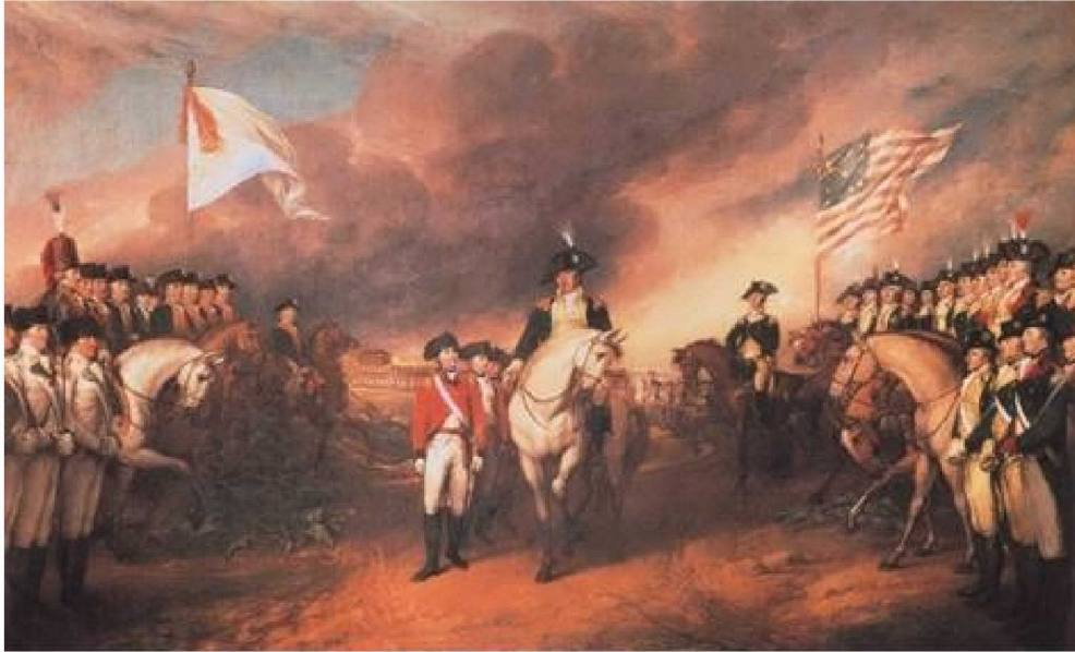
Figure 3. Surrender of Cornwallis at Yorktown by John Trumbull, 1781 59

Washington blends into the background. He is mounted, but his act of deference to Lincoln allows him to assume a position among his men as just one of many citizen-soldiers.