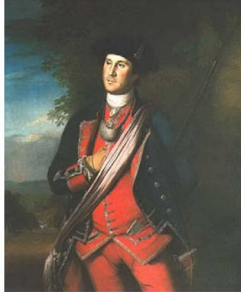
Figure 1. George Washington by Charles Willson Peale, 1772 42

demonstrated ability in his own men, believing, like the Greeks, that promotion and selection for higher responsibility should be based solely on merit. Perhaps this part of his philosophy has its roots in the fact that he was repeatedly denied a commission in the regular British army simply because of his status as a colonial—and it was fueled by the seemingly endless string of inept aristocratic British officers with whom he came in contact.