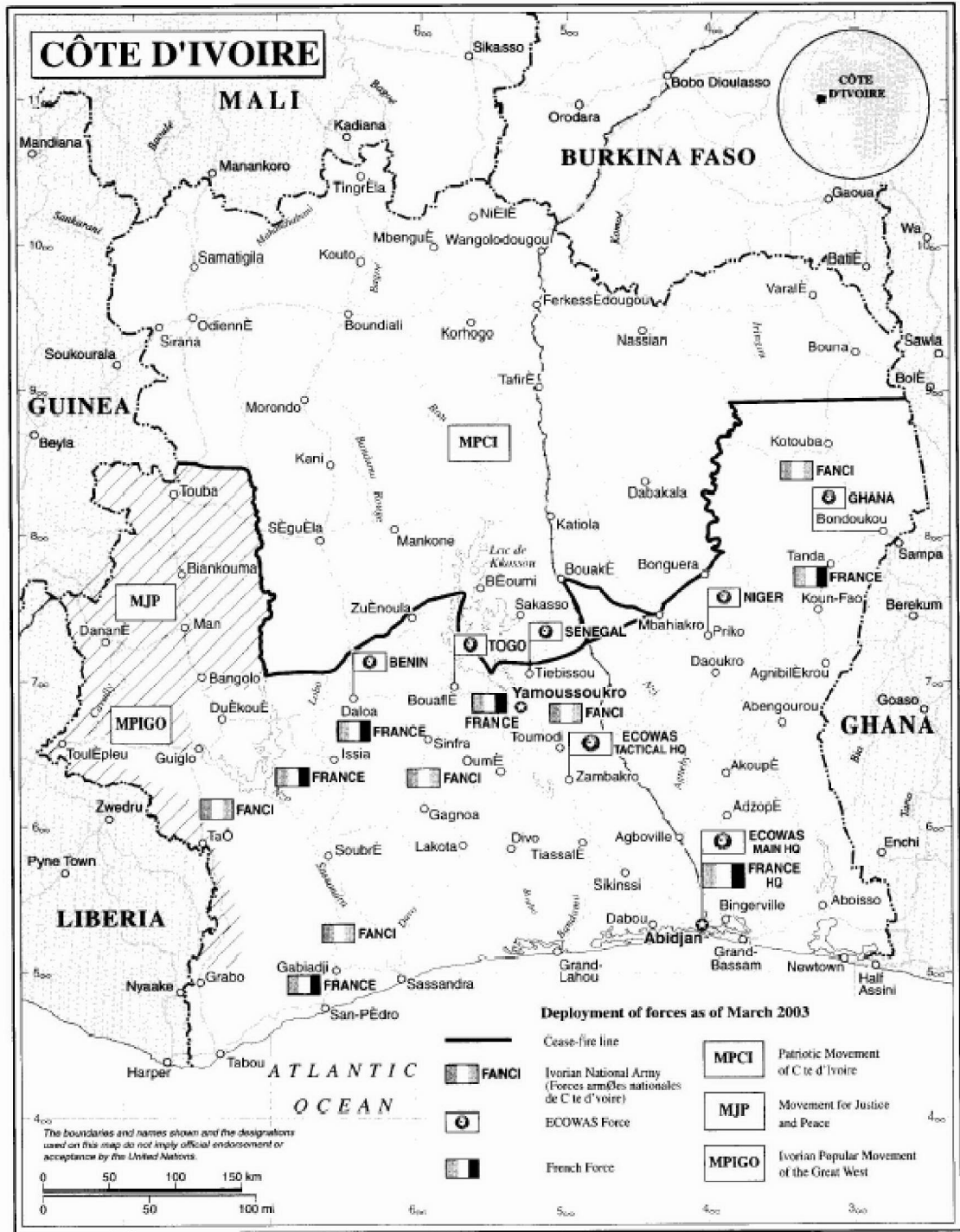
Figure 2. Map of Cote d'Ivoire Showing the Deployment of ECOMOG Forces Along the Line of Cease Fire 105