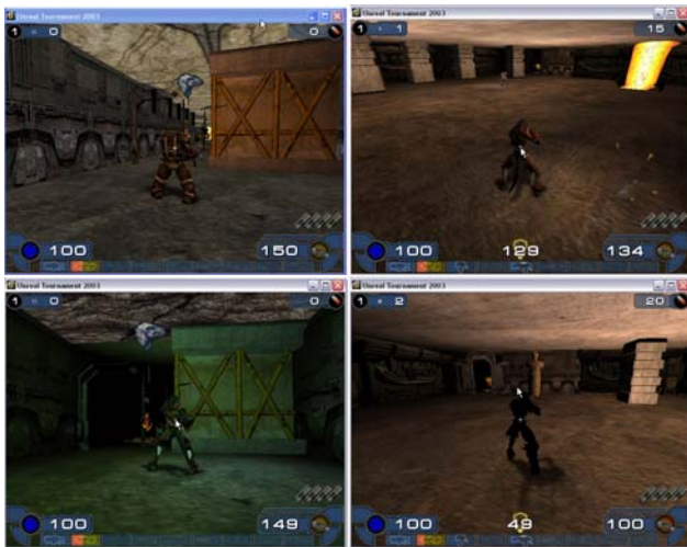
Fig. 2. Different Levels lit using ELE

Using ELE designers were able to quickly set the lighting design without worrying about low-level details of placements, angles, or color. This expedited the development process. Figure 2 shows three different levels within UT2003 lit using ELE. This did not require any designer interference, except for initial setting of constraints specifying priorities for the lighting design goals. As shown, figure 2 illustrates different renderings where ELE was configured differently in regards to contrast and overall atmosphere. The upper left image shows a scene where ELE was configured for good visibility, while the lower right image shows a scene where ELE was configured for mood lighting, and thus the character in the lower right scene was backlit. The two right scenes are set for a low-key torch lighting, while the image of the scene in the lower left shows a more cinematic lighting style with shades of green.