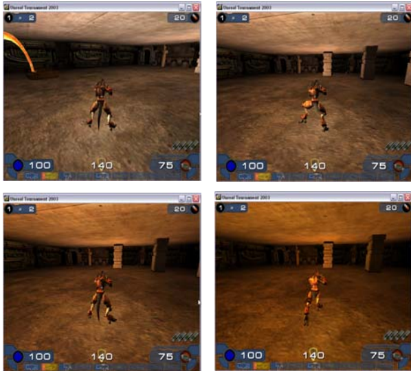
Fig. 4. Visual Tension in the Scene

As a testing case, I have configured ELE to increase tension every 2 milliseconds in the game, thus, producing results shown in Figure 4. As shown in the figure, ELE varies the visual tension level portrayed while maintaining visual continuity and general color style of the scene, which is a torch lit scene in this case. I have not yet validated the technique's perceptual effect or interaction impact. However, the technique is comparable to other techniques used in cinematographers and animators (Alton, 1995; Block, 2001; Bucklan, 1998).