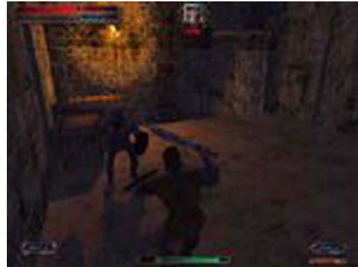
Fig. 1. A Screenshot from Blade of Darkness

towards us) is fighting another character (facing us) who is barely visible, and in this case the participant cannot determine if his/her sword touched the other character or not, which frustrates him/her and diminishes his/her engagement. This problem surfaces in many other 3-D applications as well.