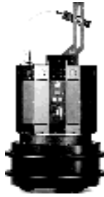
Figure 3. A Nomad 200 mobile robot with mounted camera

The semi-autonomous robot in this investigation, which we have nicknamed “Coyote,” is a mobile Nomad 200, manufactured by Nomadic Technologies, Inc., and equipped with 16 Polaroid sonars and 16 active infrared sensors. It is capable of detecting and incorporating gesture into various verbal commands (Figure 3).