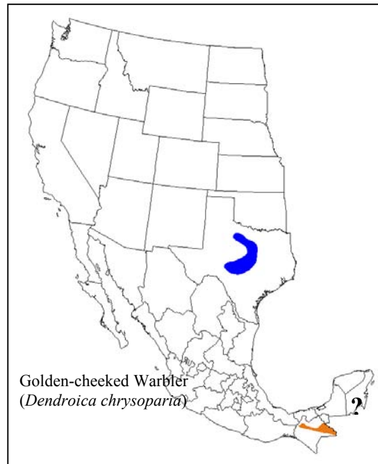
Figure 3. Breeding and wintering range of the golden-cheeked warbler in North America and Mexico (adapted from Ladd and Gass (1999) and the National Geographic Society (1999))