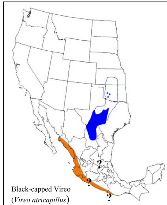
Figure 2. Breeding and wintering range of the black-capped vireo in North America and Mexico (adapted from Grzybowski (1995) and the National Geographic Society (1999))

Texas, the species range is concentrated along the geological fault line known as the Balcones Escarpment, with highest abundances observed within the Edwards Plateau (Grzybowski 1995). During the winter, this vireo is found along the Pacific slope in western Mexico (DeGraaf and Rappole 1995, Grzybowski 1995); however, the extent of the wintering range is poorly known.