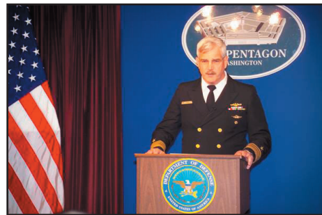
Student CNO conducts a press briefing.

During the last week of March and the first week of April, the U.S. Army War College students dealt with crisis situations ranging from major combat operations to humanitarian assistance, as part of the eleventh annual Strategic Crisis Exercise (SCE). This capstone learning event is a key part of the College curriculum designed to develop the next generation of strategic leaders. These will be leaders who will operate in a challenging joint, interagency, inter-governmental and multinational setting.