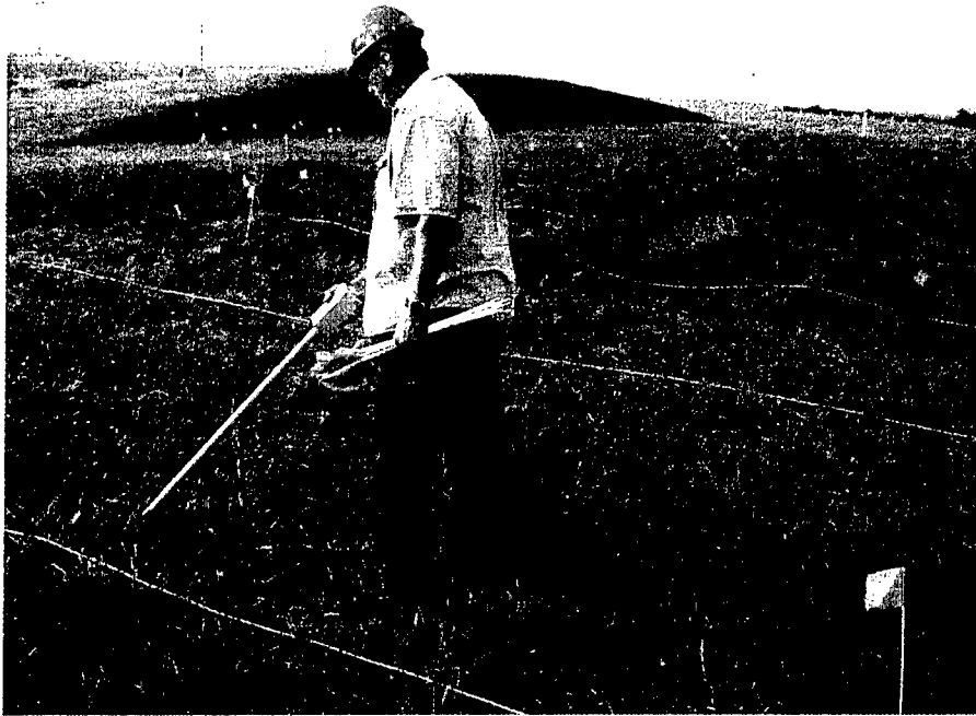
Figure 1. Demonstrator's system, magnetometer schonstedt/hand held.