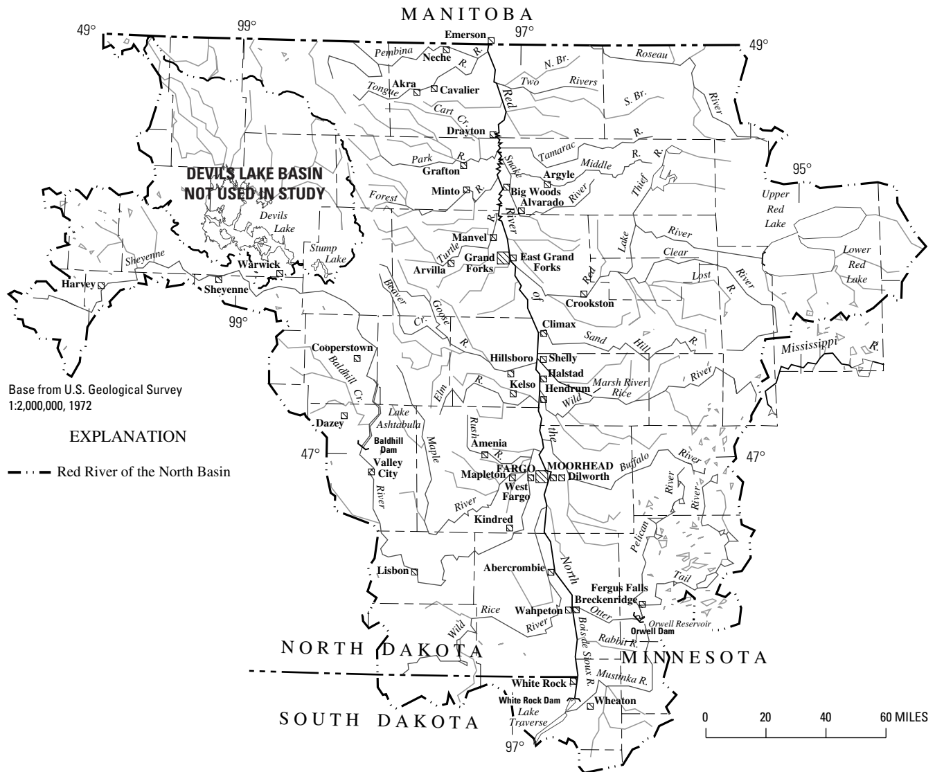
Figure 1. Location of selected cities, towns, and hydrologic features in the Red River of the North Basin.

In addition to the Otter Tail and Bois de Sioux Rivers, the Red River of the North has other large tributaries. In North Dakota, some of the larger tributaries are the Wild Rice, Sheyenne, Goose, Forest, Park, and Pembina Rivers. In Minnesota, some of the larger tributaries are the Buffalo, Wild Rice, Sand Hill, Red Lake, Middle, and South Branch Two Rivers. The tributaries vary in size, length, and direction of flow. Withdrawals and return flows occur within most of the tributaries and also from several major impoundments, such as Lake Ashtabula and Orwell Reservoir.