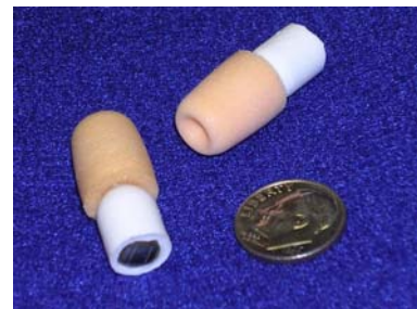
Figure 2. OCEP earplugs with foam canal tips

Foam earplugs shown in Fig. 2 provide a high quality seal to the ear canal in disposable, single use earplug. The OCEP earplug can be configured to accept replaceable Comply™ type disposable foam ear tips. A replacement foam ear tip simply screws onto the OCEP earplug body.