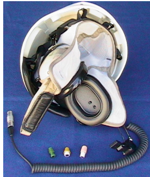
Figure 1. OCEP earplug implementation

In addition to creating difficulty in don and doff, the connecting wire creates a snag hazard for the user.