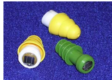
Figure 3. OCEP earplugs with reusable silicone ear seals.

OCEP earplugs with reusable, flanged ear tip styles were also developed. These are shown in Fig. 3. Ear tips of this type have somewhat reduced passive hearing protection compared to the foam ear tip styles but in some cases provide superior comfort.