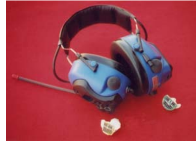
Figure 4. Two-way PBLEP earplugs in a walkie-talkie headset