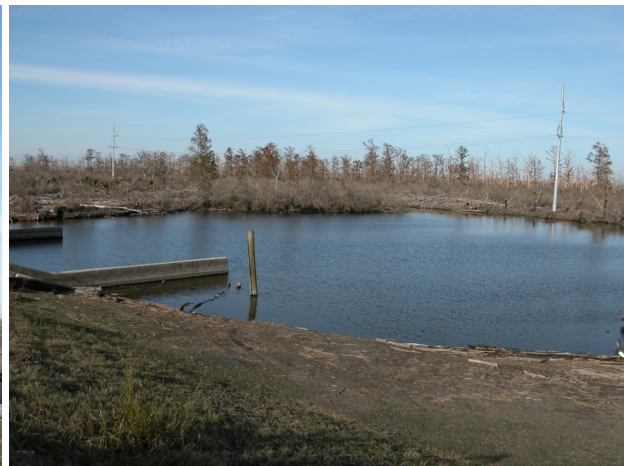
Figure 3. Pump 4 Basin

Although no samples were taken for sediment grain size analysis, visual examination of the materials during sampling indicated that all were very fine, unconsolidated sediments with substantial amounts of decaying vegetative matter. Later examination of the sieved samples confirmed this observation. Water quality was measured at the surface of the water column using