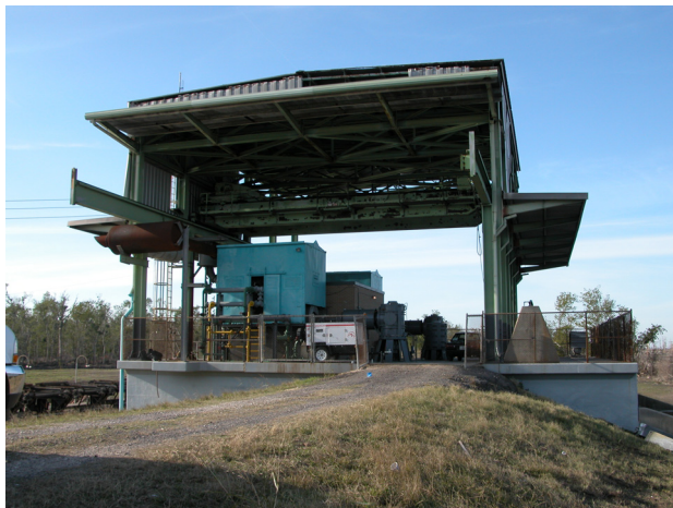
Figure 2. Pump 4

METHODS: Three infaunal samples were taken in waters approximately 1 m in depth at each site (Pumps 2, 3, 4, and 6) using a pole-mounted Eckman dredge (232 cm 2 /sample). Samples were rinsed in the field using a sieve bucket with a 0.5-mm mesh screen, placed in labeled cloth bags, and fixed in 4-percent formaldehyde solution. After fixation the samples were transported to laboratory facilities at the U.S. Army Engineer Research and Development Center (ERDC), Vicksburg, MS, where the samples were rinsed with fresh water over a 0.5-mm sieve and material retained on the sieve stored in 70-percent ethanol. Samples were subsequently stained with Rose Bengal and examined under illuminated 3X magnification to facilitate removal from the sediments. All specimens were identified to the lowest practical identification level and counted.