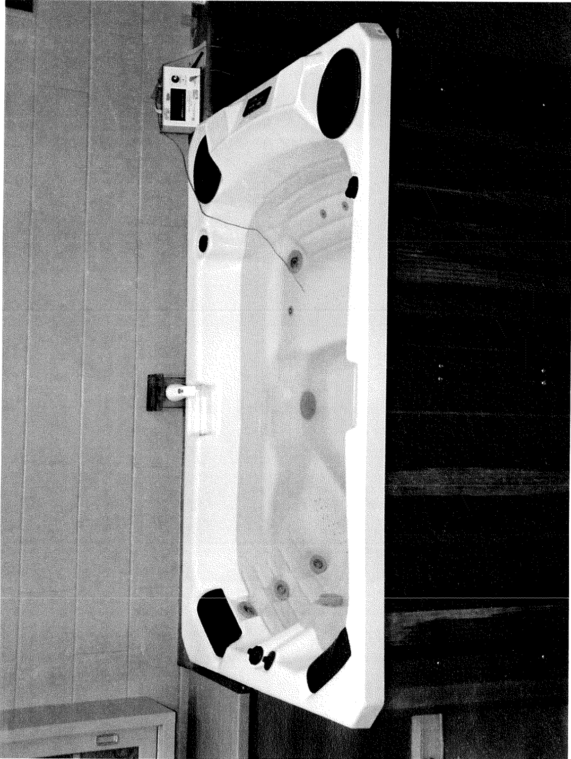
Figure 2. Emergency re-warming pool for relief from acute hypothermia.