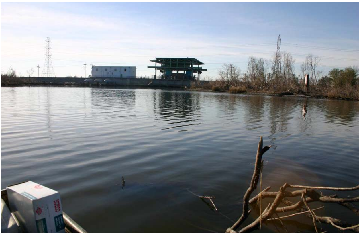
Figure 3. Pump Station Jean Lafitte #6 sampling station (pumped).