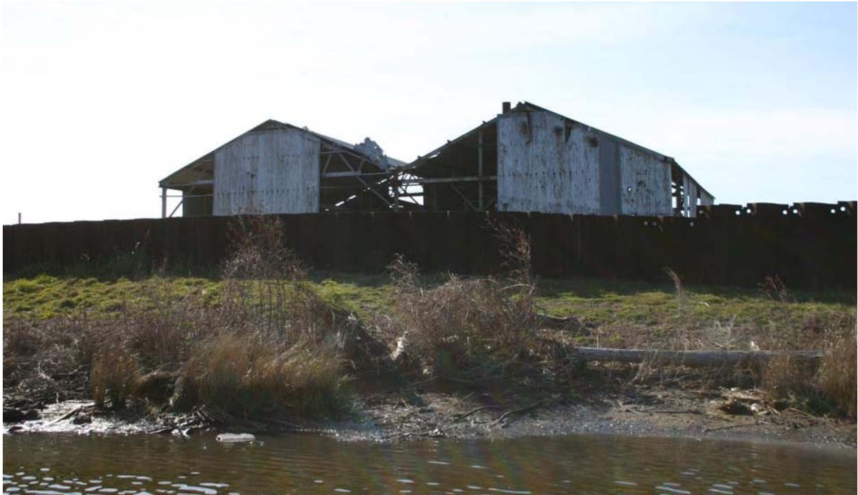
Figure 4. Pump Station Guichard #2 sampling station (did not pump).