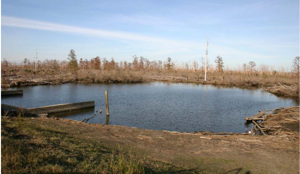
Figure 2. Pump Station Meraux #4 sampling station (pumped).