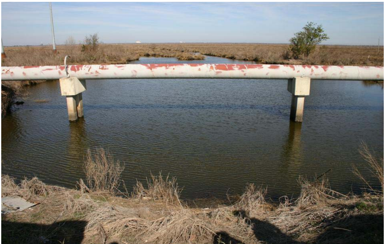
Figure 5. Pump Station Bayou Villere #3 sampling station (did not pump).