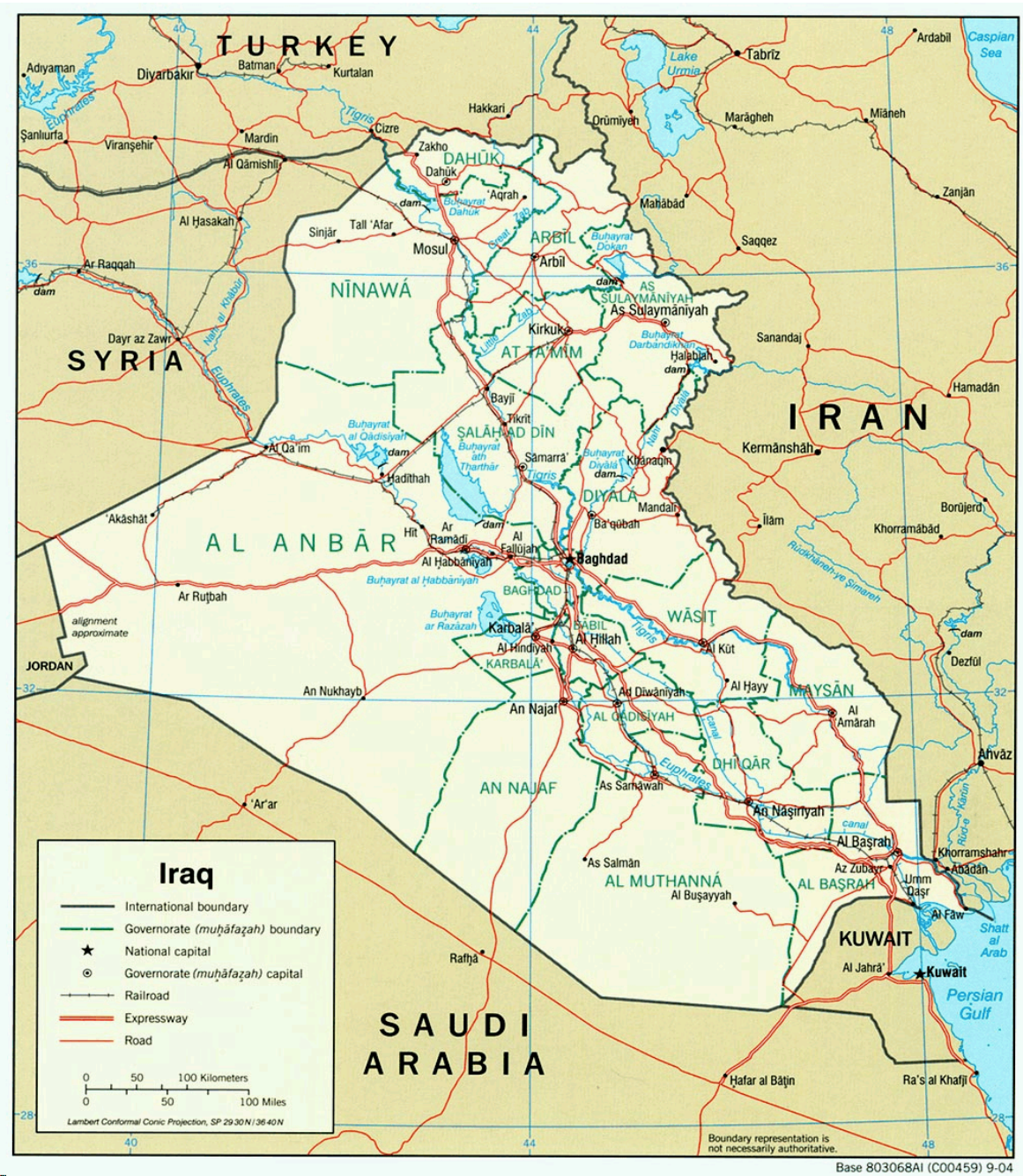
Figure 1. Map of Iraq