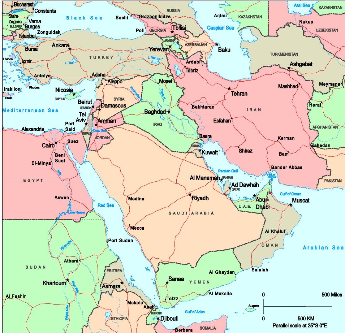
Figure 2. Map of Middle East

Source: Map Resources. Adapted by CRS. (01/03 M.Chin)