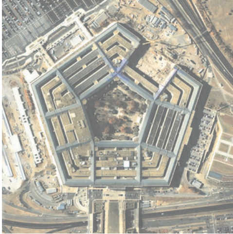
The Pentagon—November 20, 2001.

October 1, 2002, saw the establishment of USNORTHCOM at Peterson Air Force Base in Colorado. USNORTHCOM's area of operations includes the United States, Canada, Mexico, parts of the Caribbean, and the contiguous waters in the Atlantic and Pacific oceans. The Command is responsible for land, aerospace, and sea defense of the United States and will command U.S. forces that operate within the United States in support of civil authorities. It will provide civil support not only in response to attacks but also in the event of natural disasters. As the operational Combatant Commander for