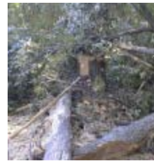
Graphic 29 – Cut Oak Tree

While operating the cutter head perpendicular to the poplar tree, the operator had to stop operations several times allowing the cutter head to build up speed. This problem appeared to be solved later by holding the head at a 45° angle while cutting the oak tree. Timberline said that faster times could be achieved if sharper blades were used. The current blades were old and dull in anticipation of ground excavation. Dramatic differences were seen in the TAZ II's ability to handle .21m verses .31m diameter trees. Although the TAZ II system may not be as fast as other systems when working with extremely large trees, it does handle all tree sizes and can also excavate the ground to minimize the remaining stumps.