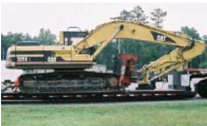
Graphic 6 – TAZII on trailer

The TAZ II was transported to the test site on a “low-boy” trailer in one piece as seen in graphic 6, below, therefore, assembly of the system prior to operations was not required. TAZ II was driven off of the trailer and with a quick pre-operations check the system was ready for operations. The TAZ II is transportable by truck, rail or vessel. However, due to its weight and width, many restrictions are imposed on its truck transport in the U.S. This is an issue that must be considered in relation to demining efforts in third world countries that have poor road and bridge infrastructure. A support package could easily be moved in a standard 20 or 40-foot ISO container, depending on the contents of the package. The system is a rugged tracked system and is mobile in most conditions, but very steep hills, slopes or rocky conditions would affect its maneuverability.