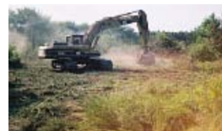
Graphic 16 – Cat. 3 during final cut