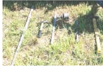
Graphic 32 – Tools used in demonstration

The TAZ II daily maintenance can be performed by one person in 10-15 minutes. The daily maintenance consisted of a walk around where the operator looked for oil leaks, cracks, and loose parts. Next, the oil level was checked as well as the water level. The engine was given a visual inspection for abnormalities. The oil level for the cab swing, the fuel level, and the hydraulic levels were all checked. Finally, all of the mirrors were cleaned prior to use.