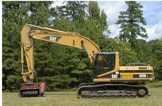
Graphic 1 – TAZ II

The TAZ II is a large tracked Caterpillar Corporation vehicle (325B L Excavator) with a specialized vegetation cutting attachment developed by Timberline Environmental Services. See graphic 1. Timberline Environmental Services has been involved in vegetation clearance for nearly 23 years, supporting both civilian and military organizations. Military support missions have dealt primarily with unexploded ordnance (UXO). By utilizing the Caterpillar base carrier, the TAZ II System has the worldwide product support of the Caterpillar Corporation. The system is capable of masticating all vegetation ranging from light grasses to large trees, as well as excavating the ground. For demining purposes, this tool could be used in conjunction with other tools (rakes, magnets, rollers, etc.) to clear large areas of vegetation, allowing deminers and dogs to completely clear the area and perform quality assurance. The TAZ II is not currently armored or remote controlled to provide safety to operators, but could conceivably be modified to have these capabilities.