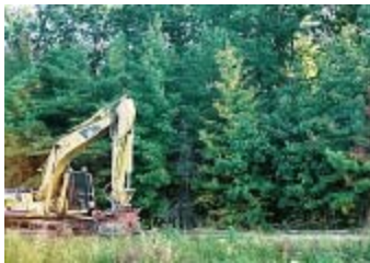
Graphic 19 – Cat. 4 before cut

Category 4: TAZ II cut 168m 2 in 53 minutes with a rate of 3.17m 2 per minute, which is significantly less than the other three categories. This site consisted predominantly of pine trees with some oak and poplar trees intermixed, shown in graphic 19. The trees were matured and estimated to be up to 18m in height and .38m in diameter. A highly skilled operator would be needed for this category more than any other. The TAZ II operator cut the small trees 1/3 up the trunk and then mulched them down. Taller trees were cut higher up at ~5.5m above the ground (3/4 of TAZ II's maximum reach). The operator cut the trees within .6m of the ground to improve his visibility before cutting closer to the ground. The masticating head applied significant ground pressure and impacted the ground in order to mulch up the stumps, particularly those stuck in dips in the terrain. The mulch ranged in length from 1 to 20 centimeters, with the majority around 15cm. The trunks and vegetation that fell into the ditch were not mulched very well. Some of the significant remaining pieces of trunks and branches were 3m in length. The very large tree trunks slowed the cutter head's rpm's down and at times, stalled the cutter head. This did not limit TAZ II's ability only increased the amount of time required to cut the trees. Overall, the TAZ II did a satisfactory job cutting category 4 vegetation.