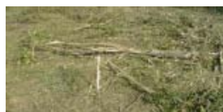
Graphic 17 – Cat. 3 un-mulched limbs