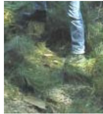
Graphic 28 – Cut Pine Tree