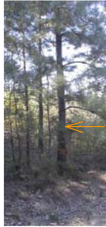
Graphic 24 – Pine Tree .21m in diameter