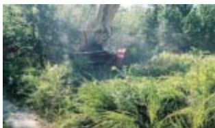
Graphic 14 – Cat. 3 initial cut

Category 3: This site contained sumac and medium size trees on hard and dry ground, as shown in graphic 14. Also contained in this site were some trees up to .3m in diameter and a tree grouping of .3m by .6m across the diameter. TAZ II cut category-3 vegetation in 21 minutes covering an area of 562m 2 and achieving a cutting rate of 26.76m 2 /minute. TAZ II mulched most of the vegetation and left the remaining stubbles around .1-.3-m in height. TAZ II left the site with a thin layer of mulch and some tree limbs and trunks that were not mulched up, as shown in graphic 17. The tree limbs and trunks ranged from .3m to 2.8-m in length. The quality of ground clearance was acceptable for the dogs and the deminers to follow with demining activities, as shown in graphic 18. However, another cut would eliminate most of the stubbles, but was not necessary. The TAZ II performed the best in this category of vegetation, which contained less sumac and more medium size trees with some grass amongst them.