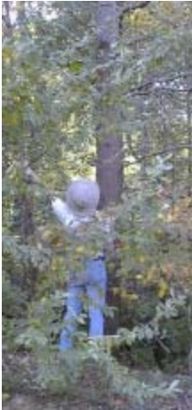
Graphic 22 – Pine Tree .31m in diameter