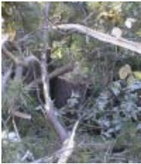
Graphic 26 – Cut Pine Tree