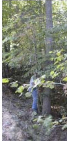
Graphic 23 – Poplar Tree .31m in diameter