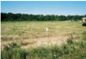
Graphic 9 – Cat. 1 after cut