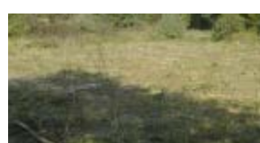
Graphic 18 –Cat. 3 after cut