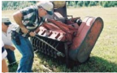
Graphic 31 – Knife changing demonstration

The special cutting head does not have a technical manual or parts manual to determine level of effort to support it, however, most of the parts for the cutting head are repairable or are considered consumable. It is assumed that simple servicing of cutting knife (blade), cutting disc and bearing repair/replacement would be required, as a minimum. Because of the proprietary hydraulic and electrical configuration used to run the cutter head, Timberline would require one of their mechanics to install the cutter head system onto the Caterpillar vehicle. Most general maintenance can be done on the cutter head with one or two people. Timberline demonstrated that two people could change a cutting knife in 6 minutes as shown below in graphic 31. The following tools were used during the knife changing demonstration: a sledge hammer, a large socket wrench, a pry bar, a solid round stock, and a small mallet. The tools are shown in graphic 32 below.