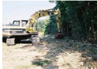
Graphic 20 – Cat. 4 during cut