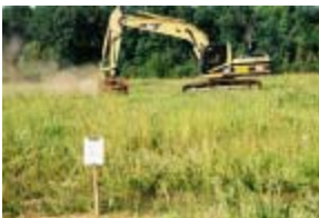
Graphic 8 – TAZ II cutting Cat. 1