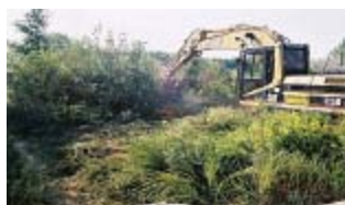
Graphic 15 – Cat. 3 during cut