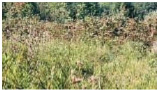
Graphic 11 – Cat. 2 before cut

Category 2: Category 2 site contained predominately of sumac intermixed with other saplings and grass, as shown in graphic 11 on the next page. The sumac stood up to 3m tall. The TAZ II cut 357m 2 of category-2 vegetation in 11 minutes, achieving a cutting rate of 32.45m 2 per minute. The TAZ II swept the area twice in the time taken but did not achieve a clean enough result for the deminers or the dogs to follow. The ground would probably require a second cut or more time taken during the first one. The vegetation could have been cut cleaner and closer to the ground if the driver had taken more time. Some of the saplings were flattened down and were not cut. TAZ II scattered the mulch in and around the site as shown in picture 12. The condition of the ground after the cut was very coarse with stubbles ranging from .3-.6m high. The site contained no significant pieces of mulch, but a pile of mulched was left by TAZ II as shown by the red arrow in graphic 13. TAZ II mulched this type of vegetation better than grass. The system operated with very quick and smooth motion. The cutter head did not require much maneuvering since the ground was predominantly flat (~90% level). The TAZ II system showed good potential for this vegetation category.