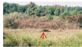
Graphic 13 – Cat. 2 after cut

Category 3: This site contained sumac and medium size trees on hard and dry ground, as shown in graphic 14. Also contained in this site were some trees up to .3m in diameter and a tree grouping of .3m by .6m across the diameter. TAZ II cut category-3 vegetation in 21 minutes covering an area of 562m 2 and achieving a cutting rate of 26.76m 2 /minute. TAZ II mulched most of the vegetation and left the remaining stubbles around .1-.3-m in height. TAZ II left the site with a thin layer of mulch and some tree limbs and trunks that were not mulched up, as shown in graphic 17. The tree limbs and trunks ranged from .3m to 2.8-m in length. The quality of ground clearance was acceptable for the dogs and the deminers to follow with demining activities, as shown in graphic 18. However, another cut would eliminate most of the stubbles, but was not necessary. The TAZ II performed the best in this category of vegetation, which contained less sumac and more medium size trees with some grass amongst them.