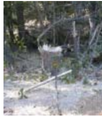
Graphic 27 – Cut Poplar Tree