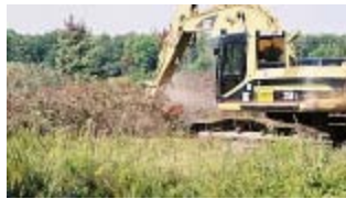
Graphic 12 – TAZ II cutting Cat. 2