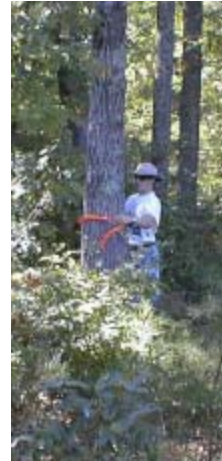
Graphic 25 – Oak Tree .38m in diameter