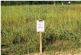
Graphic 7 – Cat. 1 – before cut

The TAZ II demonstrated its cutting ability against all four categories of vegetation and specific trees of varying sizes and hardness. Also, TAZ II demonstrated its excavating ability against hard compacted ground with the same cutting head. The results are as follows.