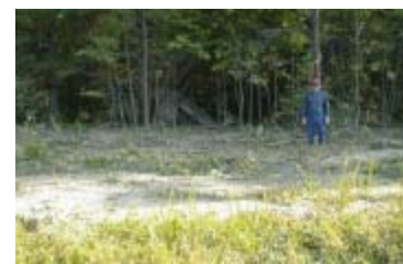
Graphic 21 – Cat. 4 after cut

Tree Cutting: TAZ II masticated four trees of varying hardness and height. Graphics 21-28 on the next page are pictures of the trees before and after they were cut. All of the trees' tops were cut off as high up as possible and then the remaining trunks were mulched down to the ground. The treetops were not mulched up. The amount of time that TAZ II took to cut off the top and mulched up the trunk was recorded for each tree. Table 2, below, displayed the tree type and dimensions, and the time the TAZ II took to cut down the trees.