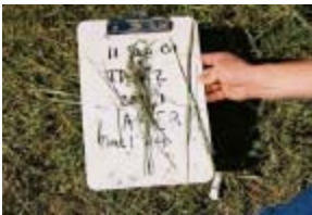
Graphic 10 – Cat.1 grass clippings from TAZ II. The clippings ranged from 5cm-20cm with the majority of clippings around 15cm.

Category 1: TAZ II cut 2500m 2 in 84 minutes with a cutting rate of 29.76m 2 /minute. It had some minor difficulties with ravines and elevation changes. TAZ II cleared the vegetation but left the ground with patchy spots of grass up to 20cm in height. TAZ II left the site in varied condition, from bared ground to vegetated spots, with the majority of the site covered in light layer of vegetation clippings. The clippings ranged between 5cm-20cm in length, with the majority of the cut vegetation around 15cm in length. A skilled operator is needed for terrain with many slope changes. The TAZ II was able to cut the light vegetation, but with difficulty. The system was too much of an overkill and the results were patchy. The time needed for the results achieved was not spectacular. TAZ II had to do two passes over the grass to get satisfactory results because of the wind flattening the vegetation down. The operation of the cutter head was smooth (no jerky, shaking motion of the machine.) The cutter head did not throw vegetation over 4 meters. TAZ II required a full 180° sweep, which resulted in a large clearance path, in order to be efficient.