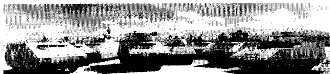
Figure 4 shows a picture of a fleet of concept vehicles, but the designs are purely conceptual at the time of this writing. Using the ACE tools, designers can make those concepts a reality, faster and cheaper than past processes.

Virtual design reviews are already being used to develop the designs for the manned ground vehicle platforms. During the vendor selection process, designs were submitted and reviewed in the CAVE™. Now, new model updates are being received regularly and the relevant players are discussing trade-offs and solutions.