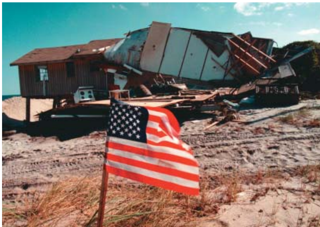
Aftermath of Hurricane Fran, September 1996

W e cannot avoid hazards, but we can act to minimize and reduce their impacts. After all, hazards do not become disasters unless the communities they touch are unprepared to deal with them. In short, disaster resilience must become inherent to our national culture and a natural right of all people. This report establishes a framework for Federal investment in science, engineering, and technology to reduce America's disaster vulnerability. Successfully reducing disasters depends upon sustained investment in these Grand Challenges and in recognizing that hazards are inherent on our complex environmental, constructed, agricultural, political, and social systems.