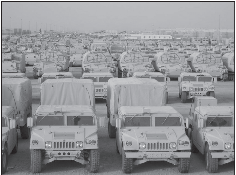
Figure 1: Existing Outdoor Storage in Kuwait

Inadequate storage facilities in both South Korea and Kuwait have resulted in outdoor storage of prepositioned equipment. Figure 1 shows the storage situation in Kuwait, with prepositioned equipment stored at outside locations.