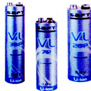
Figure 6. SAFT Developmental Cylindrical VL Cells