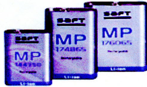
Figure 4. Representative SAFT Rolled Prismatic Cells