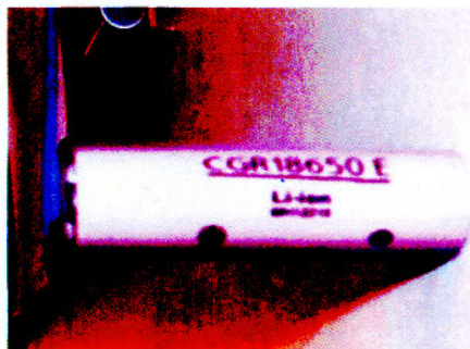
Figure 3. Panasonic Cylindrical CGR 18650 E Cell