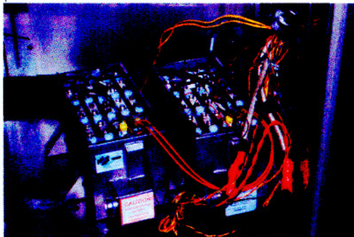
Figure 2. Two Battery Parallel Test Configuration [2]

In discussions with SAFT over which of their commercial cells would best fit our test program, SAFT personnel indicated some of their developmental VL7P 7 Ah cells could be made available from cosmetic rejects from the developmental program. These cells had increased discharge rate capability over standard commercial cells and might provide some interesting data for the study. These cells were also included in the study but have not been procured at this time.