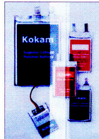
Figure 5. Representative Kokam Li-ion Polymer Cells