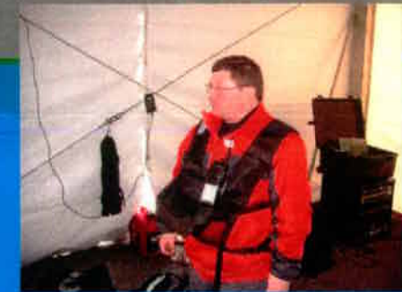
Superbowl, Detroit 2006