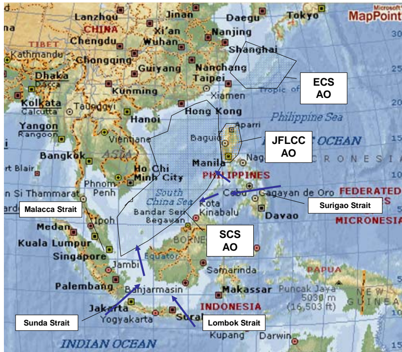
Figure 2 19

Land component forces and elements of the air component would then arrive in Luzon in the Philippines to conduct a large-scale combined arms demonstration to include the insertion of airborne forces, close air support, and air to air engagements.