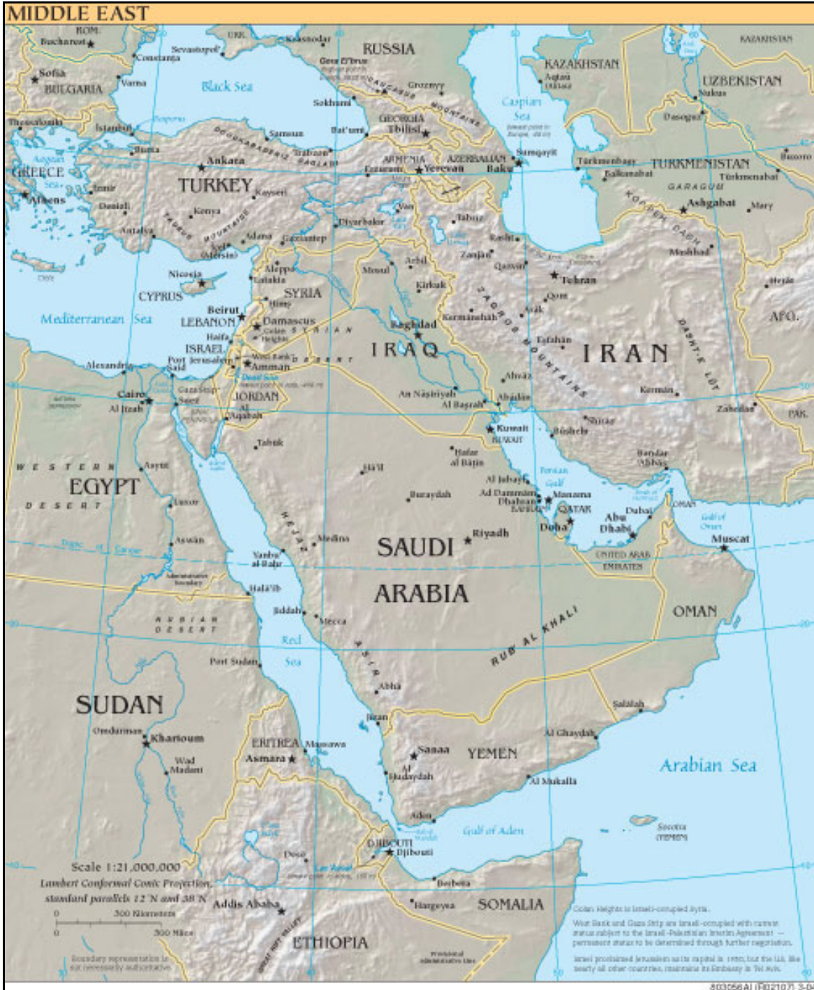
(Central Intelligence Agency 2006)