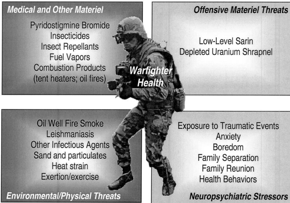
Figure 1. Examples of some of the multiple stressors surrounding soldiers during the Gulf War in 1990-1991. Warfighters are rarely subjected to one stressor at a time yet little of our research before the Gulf War had evaluated interactions relevant to military operational environments

rates, finding no differences overall in Parkinson’s disease but a higher rate for ALS [78]. A recent review of existing data by a panel at the Institute of Medicine concluded that there is an association between the Gulf War deployment and increased risk of ALS.