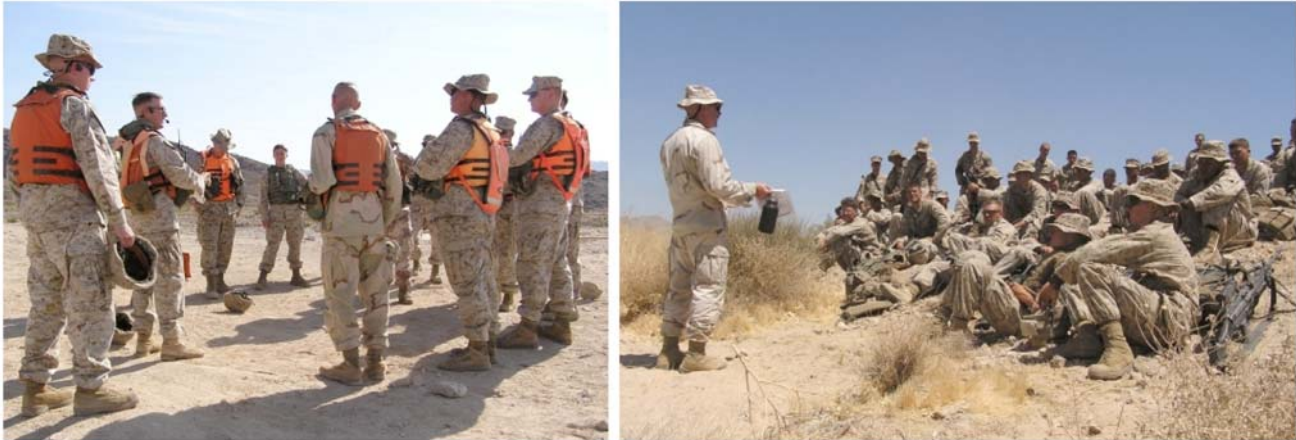
Figure 3: (a) Internal Debriefing ('Coyotes-to-Coyotes'), and (b) Unit Debriefing ('Coyotes-to-Unit').

Expert guidance for follow up training: After each training run TTECG instructors conduct a detailed debriefing with the unit ('coyotes-to-unit' debriefing, Figure 3 (b)), where they report about different aspects of the unit's performance. At the end of that debriefing session the main instructor provides an account and critique for the entire training run. This debriefing is always combined with suggestions for improvements that can be readily used to plan follow-up training actions. Bringing this to the domain of virtual training systems, the effective approach would be to provide the same level of consideration and advice, making sure that the group has a clear understanding of what kind of skills they need to improve and, equally important, advice on how to go about it.