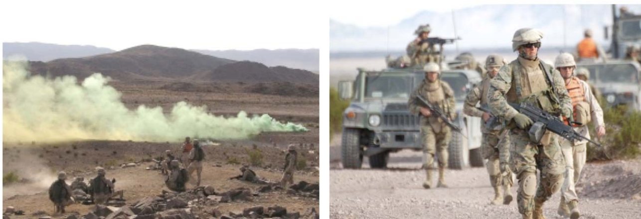
Figure 1: Scenes from two Different Training Courses in Combined Arms Training.

During past year and a half we have been actively working with USMC personnel from Twentynine Palms. This collaboration was a part of the Virtual Technologies and Environments (VIRTE) program sponsored by Office of Naval Research (ONR), and was focused on different aspects of combined arms training organized for USMC units. The major thrust of our collaboration was with two USMC groups: Tactical Training Exercise Control Group (TTECG), and the Battle Simulation Center. Under the VIRTE program umbrella we engaged in two major research activities: first, we worked on determining the baseline parameters of training provided in CAT, and second, we engaged on several transfer studies focused on the effectiveness of training with virtual training simulations used in units' preparations for the CAT. Each study involved working actively with two USMC battalions. We collected invaluable information that both supported our research efforts and helped further our understanding of this domain. While we are still in the process of analyzing the data collected, we are able to extract the results of qualitative analysis and present them in this paper.