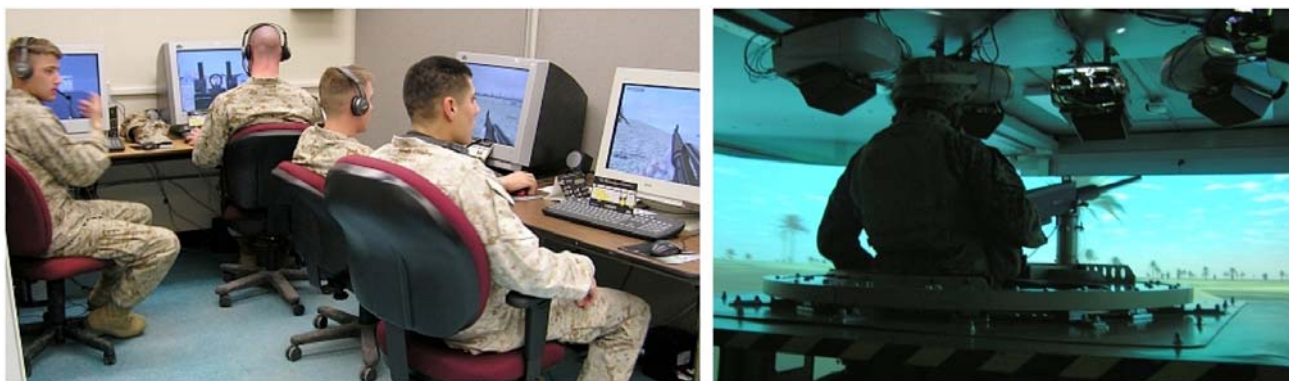
Figure 2: (a) Training using VBS System, and (b) Training using VCCT System.