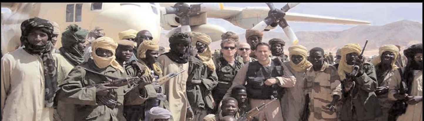
Air Force Special Operations Command advisors pose with members from the Chadian Air Force.