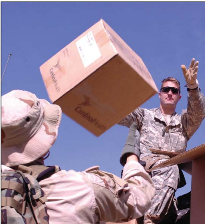
U.S. Army Special Operations medical personnel unload medical supplies during a U.S./Iraqi medical civil-military operation in Ash Sharqat, Iraq.