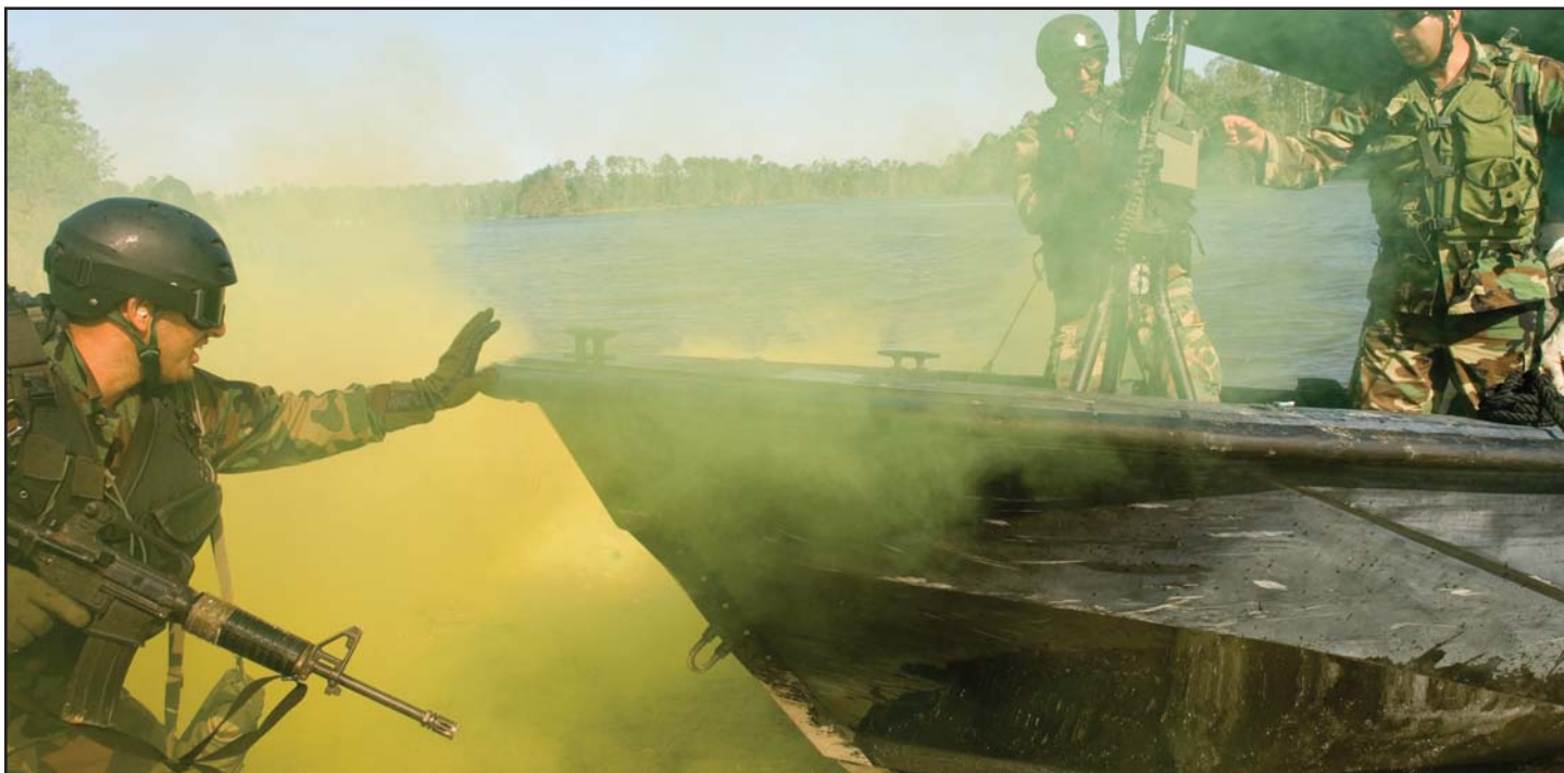
Naval Special Warfare personnel assigned to Naval Small Craft Instruction and Technical Training School train personnel from the Iraqi Riverine Police Force on special boat maneuvers and weapon handling.

graduates from the training pipelines while maintaining quality in the process. The U.S. Army Special Operations Command (USASOC) showed large gains in FY 2006 after increasing instructors and totally redesigning the Special Forces Qualification Course curriculum. A phased plan was implemented to grow from a historic average of 400-450 active duty enlisted graduates per year to 750 for FY 2006. USASOC exceeded this goal, with 762 active duty enlisted Special Forces Soldiers graduating in FY 2006. The Naval Special Warfare Command (NAVSPECWARCOM) is still facing challenges filling SEAL billets, but the Chief of Naval Operations' commitment to SEAL recruitment as a top Navy priority is helping enormously. Additionally, NAVSPECWARCOM introduced several initiatives to their training programs to increase output while maintaining current standards. Air Force Special Operations Command (AFSOC) heavily revised its training pipeline over the last few years, which began to pay significant dividends as evidenced by increasing numbers of newly qualified operators. Based on current production, AFSOC should reach its required manning levels by FY 2009. Our newest component, MARSOC, continues to grow as planned and will be fully manned by FY 2008.