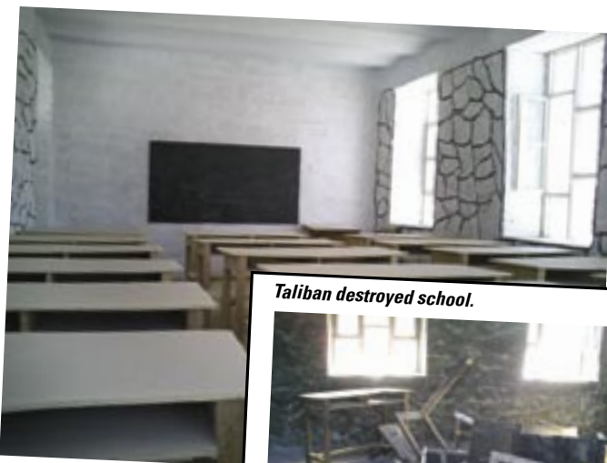
Taliban destroyed school.