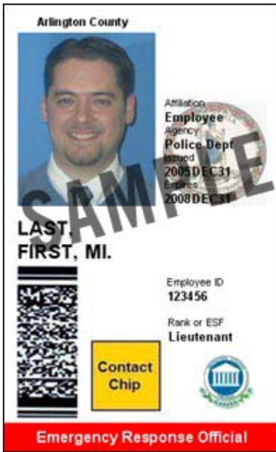
Figure 3. Example of First Responder Authentication Credential (FRAC)

The new first responder authentication ID cards manifested out of the First Responder Partnership Initiative, which includes the Department of Homeland Security (National Capital Region), the Virginia Department of Transportation (VDOT), and the Commonwealth of Virginia. The Initiative itself grew out of the Homeland Security Presidential Directive 12 (HSPD-12), which outlines a policy to enhance security, increase government efficiency, reduce identity fraud, and protect personal privacy by establishing a mandatory, government-wide standard for secure and reliable forms of identification issued by the federal government to its employees and contractors. 70 The new identification card, known as the First Responder Authentication Credentials or FRAC, closely resembles the Common Access Card (CAC) currently used by the Department of Defense. The FRAC has been issued to more than 1,400 emergency services workers already. These cards are each encoded with critical data that enables incident commanders at the scene of an emergency to authenticate the responder’s credentials by scanning the card’s internal content chip. The card has the ability to securely maintain emergency responder’s privacy data, verify first responders’