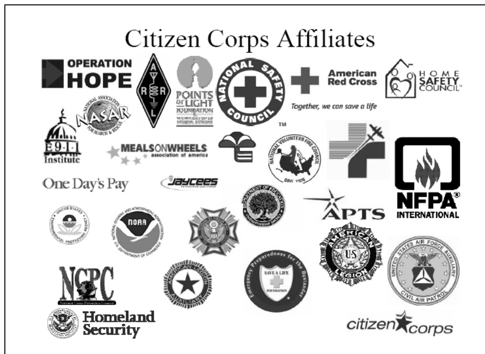
Figure 1. Major Partnerships and Affiliates of Citizen Corps (From 40 ).

may have to respond to local emergencies. Therefore, Citizen Corps takes an active role in planning, educating, and training citizens across the United States, at over 2,100 citizen corps councils, and establishing several private and volunteer partnerships and affiliates at all levels of government. Some of the prominent partners include the Medial Reserve Corps, the Fire Corps, the Volunteers in Police Service, and the American Red Cross. Post-Hurricane Katrina, many Citizen Corps volunteers worked side-by-side with Red Cross to give aid to those families in need. 39 The following table illustrates the major partnerships and affiliates associated with Citizen Corps.