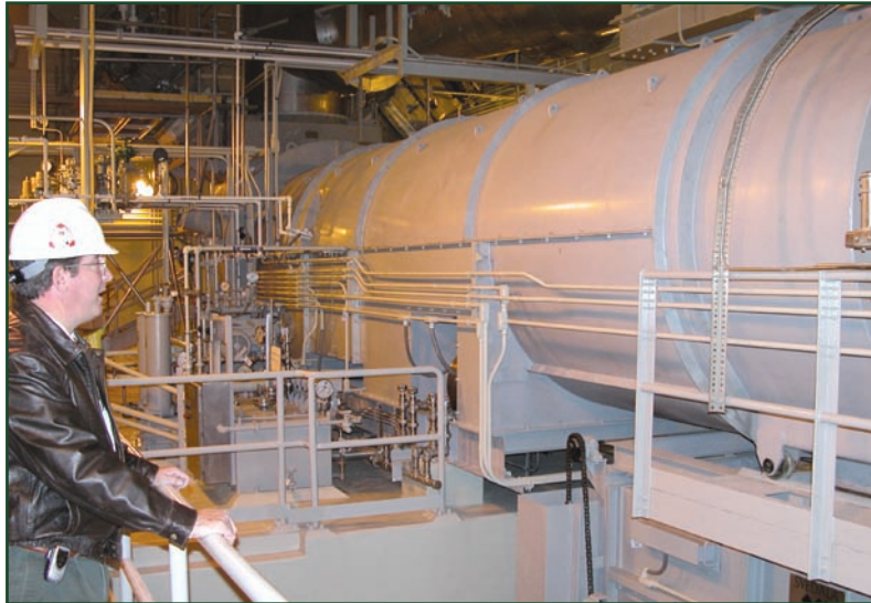
Preventive maintenance reduces equipment breakdowns and repairs and ensures safer, efficient operations.

Understanding scheduled downtime at disposal facilities (continued)