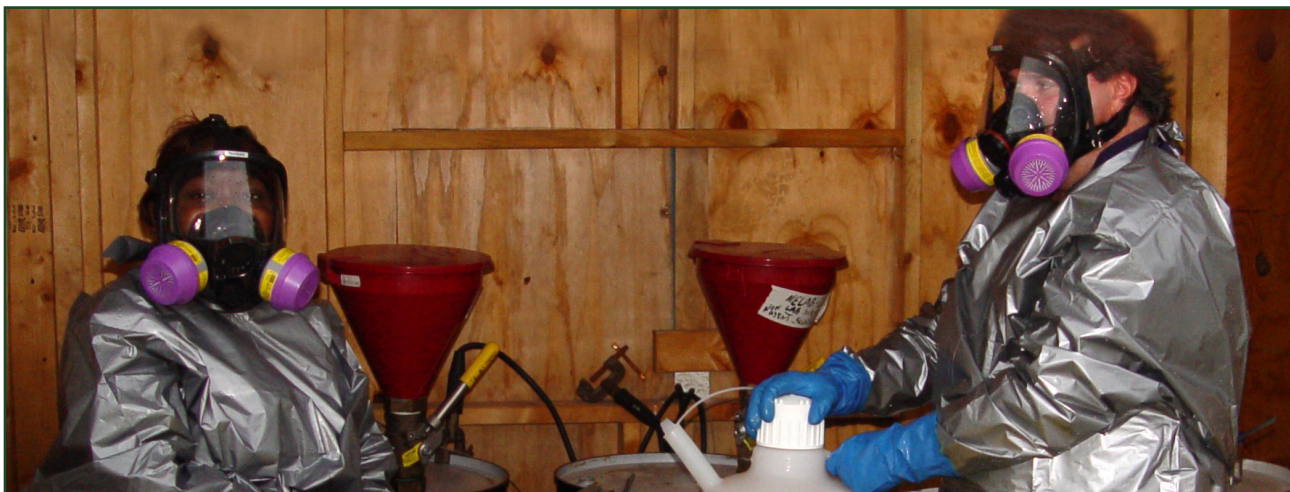
These workers are wearing the appropriate level of personal protective equipment as dictated by the type of waste being handled and STEL monitoring.

CMA continues to safely eliminate the nation's stockpile and non-stockpile chemical weapons. VSLs help CMA make a safe process even safer for workers, the public and the environment.