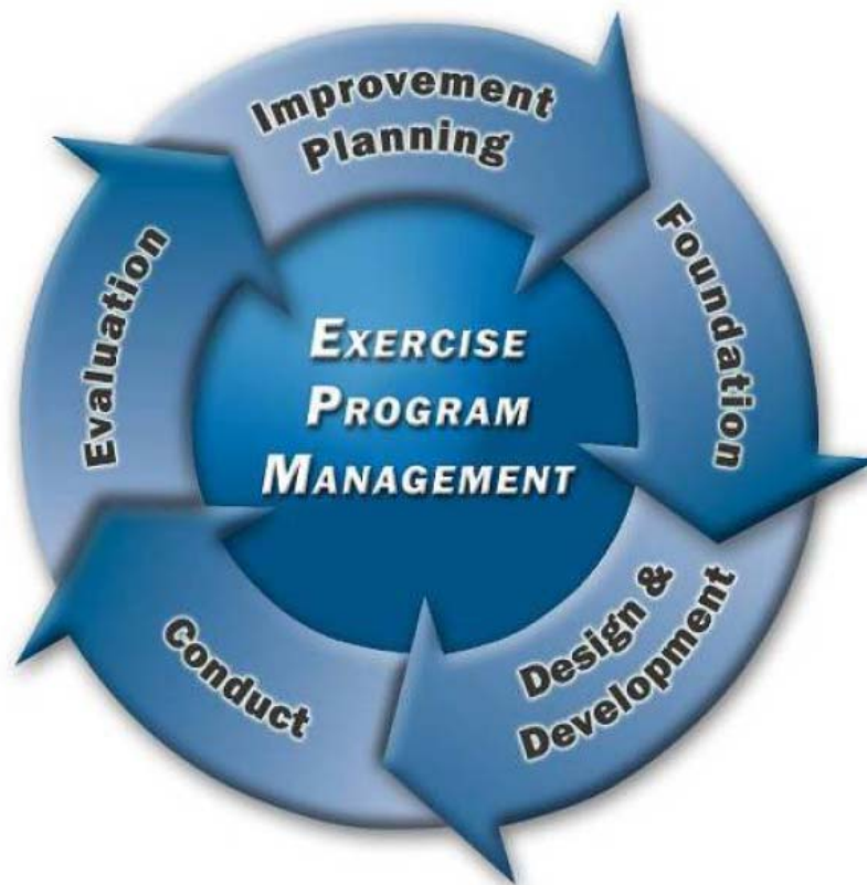
Figure 2. Exercise Program Management 63

Foundation, Design and Development, Conduct, Evaluation, and Improvement Planning. 62 These phases are depicted in Figure 2 below.