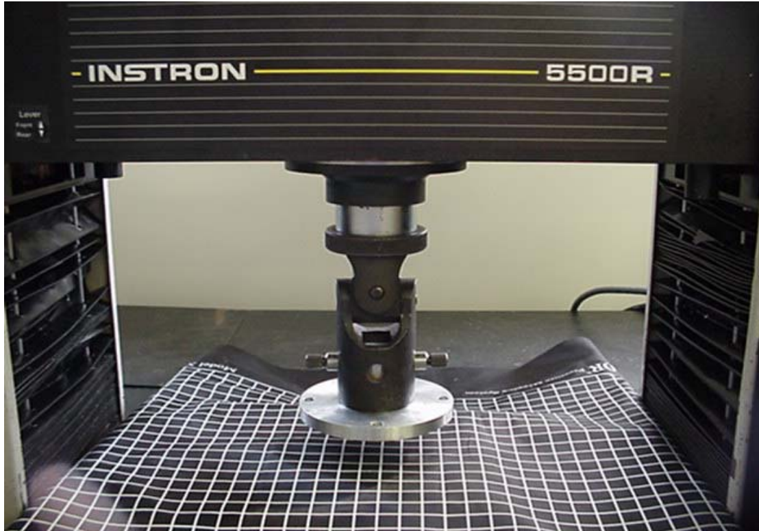
Figure 1: Set up for the XSENSOR® Pressure Pad in the Instron.